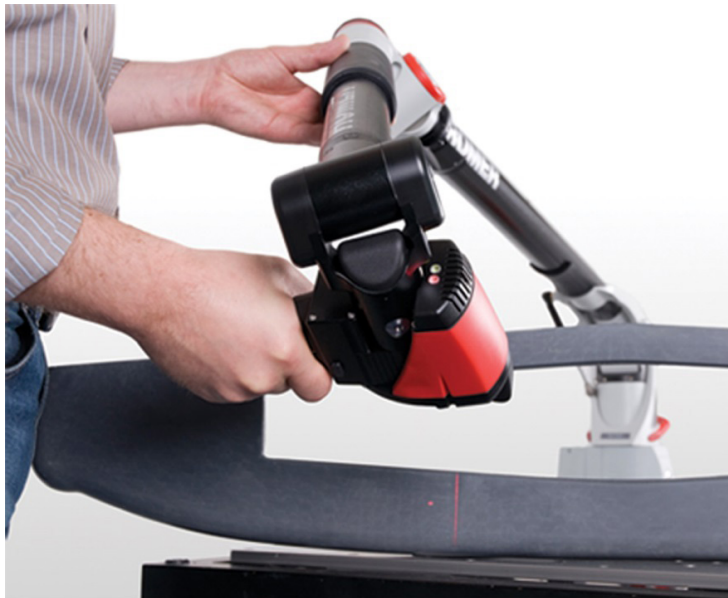
Fig. 3. Scanning arm used for measuring composite element

Delcam PowerINSPECT allows for measurement and verification of the final product and its inspection based on a 3D model. This application works with all types of stationary measuring machines as well as mobile devices and machine tool probes (fig. 3), the use of which allows not only for measurement on the machine for inspection purposes, but also for detection the actual workplane position of the models having complex geometry.