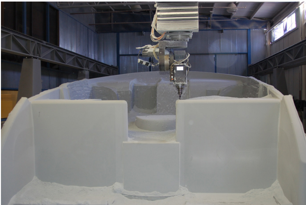
Fig. 1. Complex 5-axis milling of a large sized composite element

Delcam PowerMILL is another application used at following stages of the process. It makes it possible to use multiple advanced manufacturing techniques. This application is used both to generate technology necessary to comply with production tooling (molds) and to cut as well as trimm composite parts. Delcam PowerMILL allows for a quick calculation of complex 5-axis toolpaths with large size elements (fig. 1). The use of advanced simulation functions along with avoiding collision at the stage of toolpath calculation by eliminating the possibility of potential errors result in a reduction in execution time of the technological process and reduction of costs.