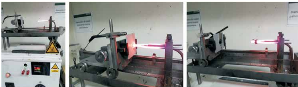
Fig. 2. GWFI test for K3

the amount of AH agglomerates in the polymer matrix (Fig. 1). This has a positive effect on the results of testing specimens after aging, because it limits the ability to absorb water and oil by the tested composites. Irrespective of the aging conditions for the composites K2 and K3, the flammability class V0 and high LOI values were in the range of 34 to 39 % for K2 and 38 to 42 % for K3. In the case of composite K1, a slight deterioration of the flame resistance for specimens subjected to aging in water at 70 °C and oil (Table 2) was observed. For samples aged in water and oil flame class was reduced to V1 and LOI decreased up to 29 % and 30 % (Table 3). The same unfavorable effect was observed in case of testing with glowing wire, the GWFI parameter was reached at 850 °C. In all other cases (Table 3), the GWFI parameter reached 960 °C. Figure 2 shows realization of GWFI test for K3.