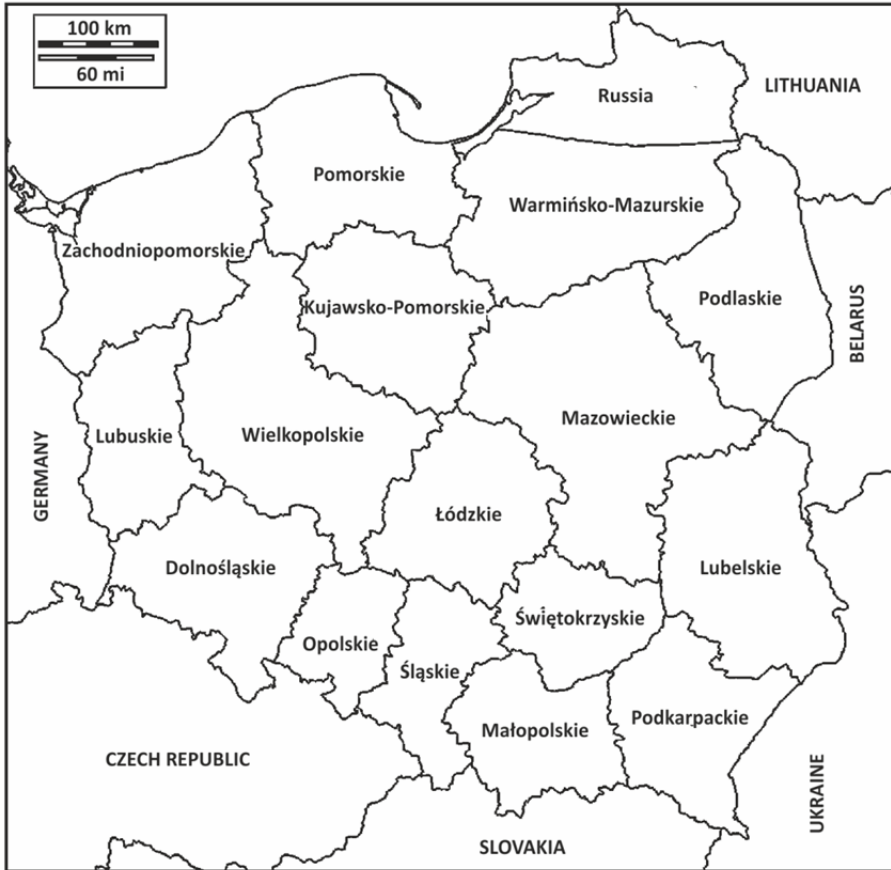
Fig. 1. Map of the regions of Poland; as in the text, the Polish names of the regions are used.

study group with the aid of both Bayesian networks and principal component analysis (PCA).