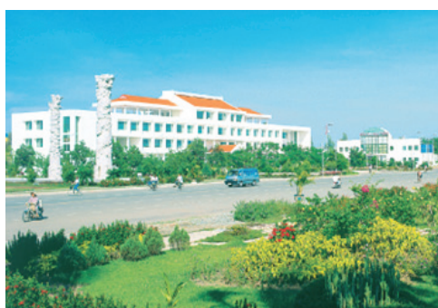
Fig. 3. The Tan Thuan Export Processing Zone – the first EPZ of Ho Chi Minh City, is also the first export processing zone of Vietnam to be established in 1991 Rys. 3. Strefa przetwórstwa eksportowego Tan Thuan – pierwsza EPZ miasta Ho Chi Minh, jest także pierwszą strefą przetwórstwa eksportowego Wietnamu, która została utworzona w 1991 r.