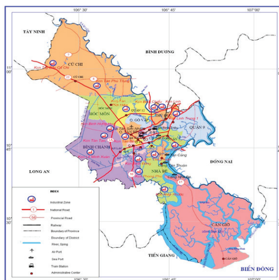
Fig. 2. Map of the location of IPs/EPZs in HCMC Rys. 2. Mapa lokalizacji IP/EPZ w HCMC