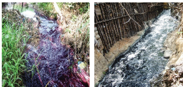
Fig. 5. Untreated wastewater discharged directly to Kenh Ba Bo, Thu Duc District, HCMC Rys. 5. Nieoczyszczone ścieki odprowadzane bezpośrednio do Kenh Ba Bo, dystrykt Thu Duc, HCMC

now, besides some industrial parks, complying with legal regulations on waste management, there are still many industrial parks have not completed the concentrated waste collection and treatment facilities [8]. Some industrial zones have built centralized wastewater treatment systems but almost do not operate because to reduce costs [10].