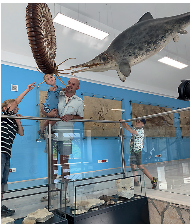
Fig. 6. The palaeontological pavilion presenting life-size reconstructions of animals which inhabited the local seas and islands during the Late Jurassic.