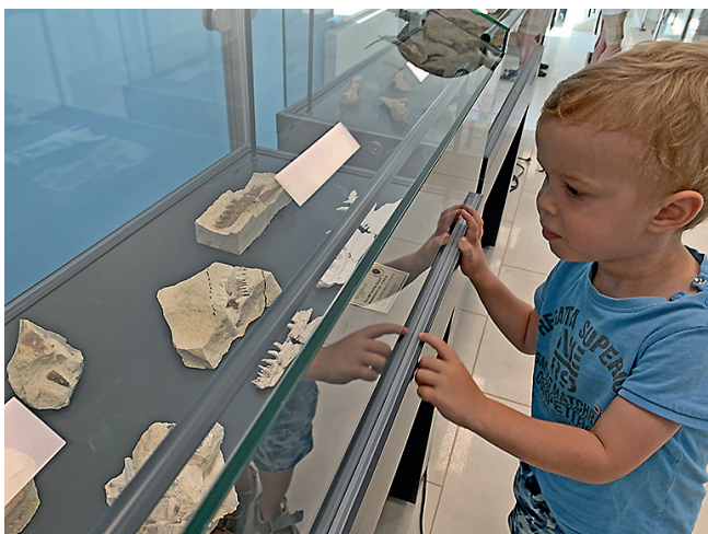
Fig. 5. Exhibition inside the palaeontological pavilion presenting fossils of Late Jurassic marine and terrestrial organisms found in the near quarry.

Gathering, securing and researching this extraordinary collection of fossils is possible thanks to the excellent cooperation between the local government (Sławno Commune Office), Nordkalk Company (owner of the Owadów-Brzezinki Quarry) and the scientific community including various institutions (Institute of Paleobiology and Museum of the Earth, Polish Academy of Sciences; Polish Geological Institute – National Research Institute; Geoscience Friends Association ‘PHACOPS’; and Faculty of Geology, University of Warsaw).