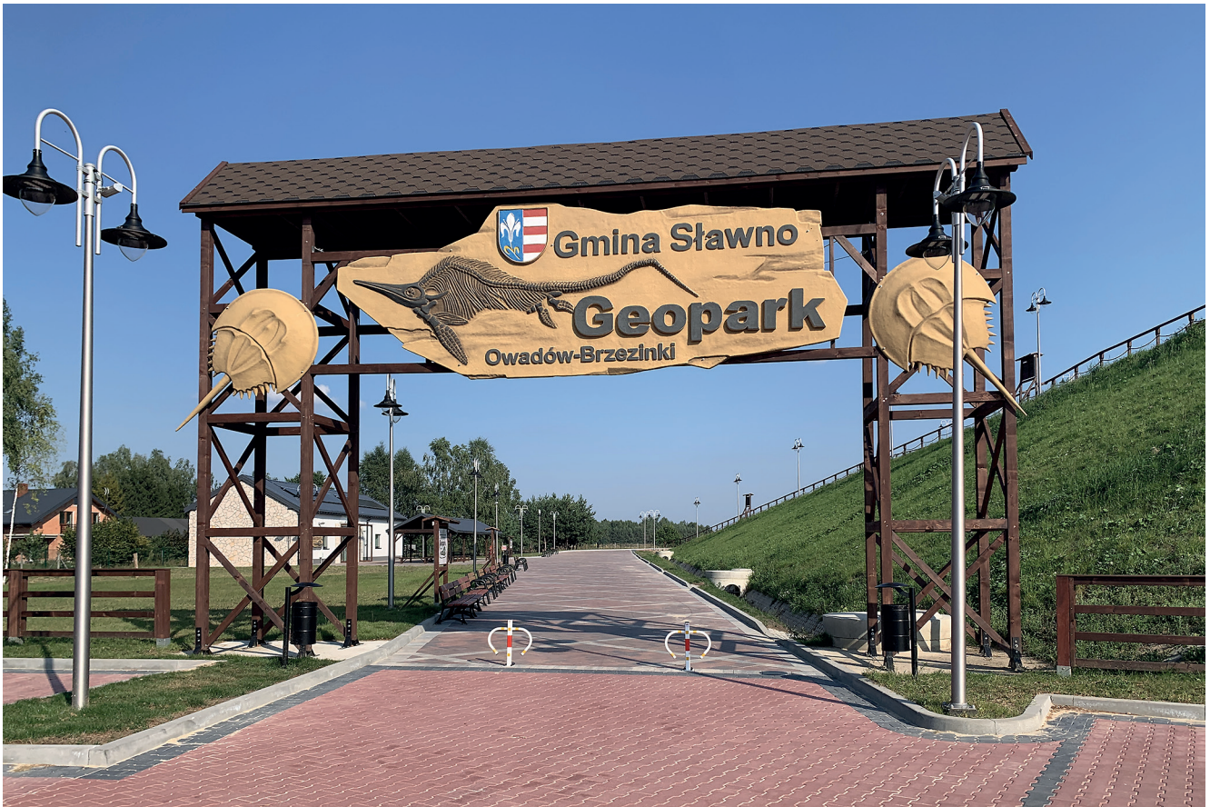
Fig. 2. The entrance gate to the Owadów-Brzezinki Geosite (geopark) in Sławno community.