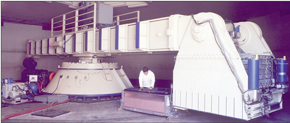
Fig. 1. Geotechnical beam centrifuge in Davis, University of California