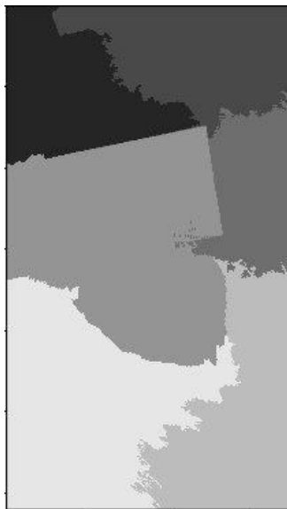
Fig. 3 Segmentation using SLIC method

collisions with created clusters. Figure 3 shows segmentation of the same image, using only SLIC method.