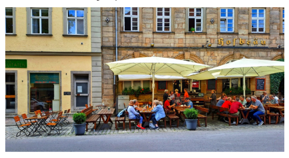
Fig. 3 Expansion of the outdoor gastronomy in connection with the COVID-19 pandemic

The high hygiene regulations and especially the distance rules that came into force after the first lockdown in May 2020 made it difficult for hospitality businesses to cover their expenditures. Therefore, the City of Bamberg allowed for the expansion of outdoor areas of restaurants and beer gardens upon request. 31 restaurants<sup>13</sup> have made use of this offer, so that the total number of outdoor bar areas in the city has doubled (Fig. 3). Not everywhere, this has led to greater distances between the seats as originally intended.