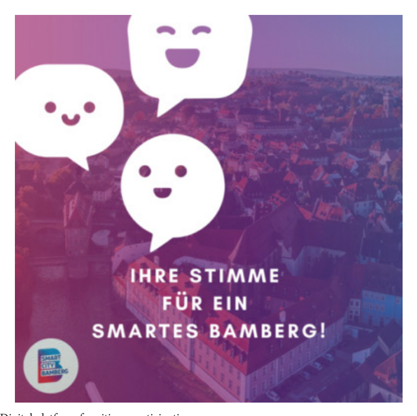
Fig. 5 Digital platform for citizen participation

Bamberg is growing and changing. Important decisions about the future development of the city involve its citizens. In line with the Recommendation on the Historic Urban Landscape Bamberg "involves a diverse cross-section of stakeholders, and empowers them to identify key values in their urban areas, develop visions that reflect their diversity, set goals, and agree on actions to safeguard their heritage and promote sustainable development". In 2020, the City of Bamberg was awarded the contract by the Federal Ministry of the Interior, for Construction and Home Affairs, for a project period of seven years as part of the "Smart Cities Model Projects" funding programme to promote digitalization at all levels of urban development. This facilitates new possibilities for civic dialogue. Among others, the digital platform https://bamberg-gestalten. de/ has been established (Fig. 5) in order to give Bambergers a greater say in shaping their city. Hybrid formats such as citizen labs also take place in this context.