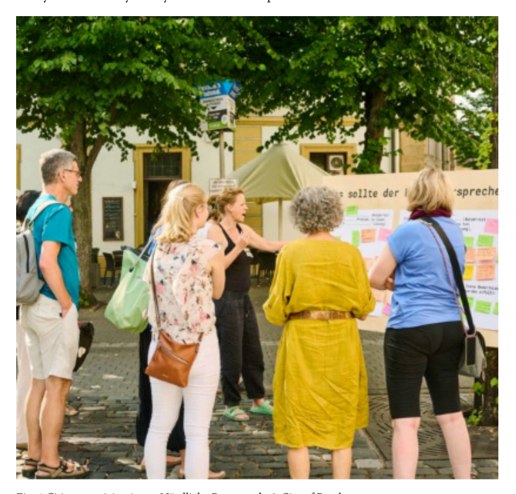
Fig. 4 Citizen participation at Nördliche Promenade

The Nördliche Promenade on the other hand, a multifunctional yet untended area in the immediate vicinity of the pedestrian zone and the central bus terminal, offers space, but little quality of stay. In July 2022, the City of Bamberg invited local residents to a community event (Fig. 4) with cultural programme to gather ideas for the redesign of the neighbourhood drawing on diversity and creativity as key assets for development.