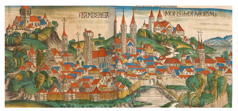
Fig. 1 View of Bamberg from the Schedel World Chronicle, 1493 (BSB Rar. 287 fol. 174'-175)

The town gained importance from the foundation of its bishopric in 1007, initiated by Henry II, who later became Holy Roman Emperor (1014-1024). The development of the bourgeois Island District, from the 12th century onwards, was accompanied by a period of great prosperity. The view of Bamberg from the Schedel World Chronicle (Fig. 1) gives an idea of the wealth of the city at that time.