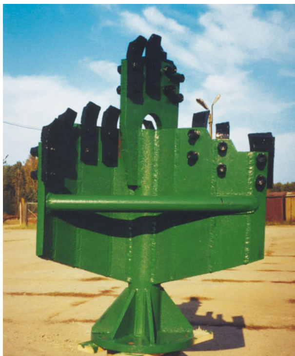
Fig. 1. Large-diameter cutter bit with profiled wings \varnothing 1.16 m

To increase the rate of drilling of large-diameter dewatering wells, a new cutter bit with profiled wings was designed (fig. 1) (Gonet et al., 1996).