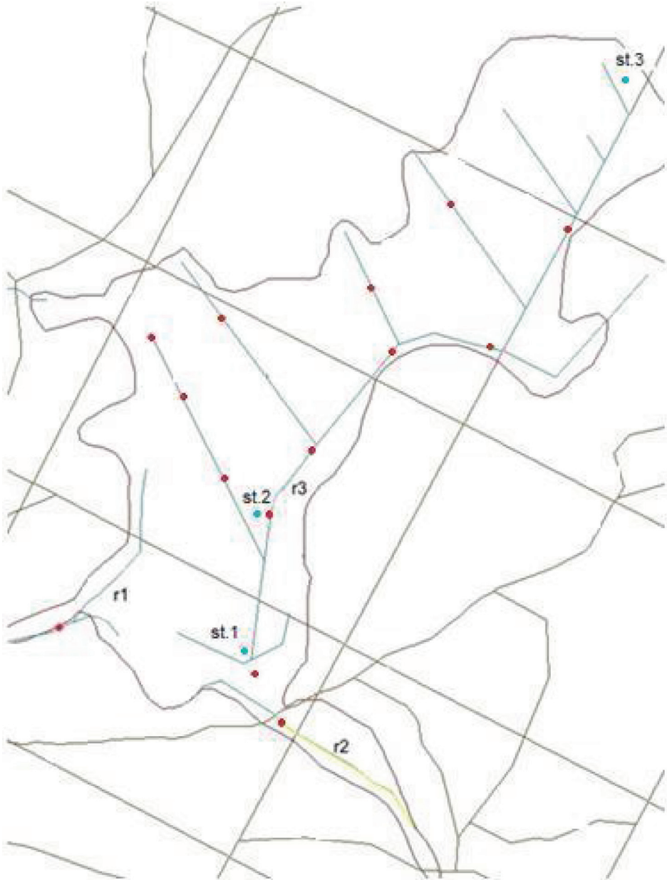
Figure 1. The location of measurement wells (●), and retention objects on the facilities (●).

and multiannual periods. That is why an analysis of impacts of functioning of constructed retention facilities should include meteorological conditions.