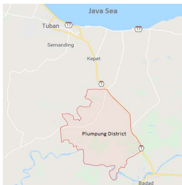
Fig. 1. Research area

These days, the estuary area of Bengawan Solo River floods frequently due to the overflow of the river, especial-