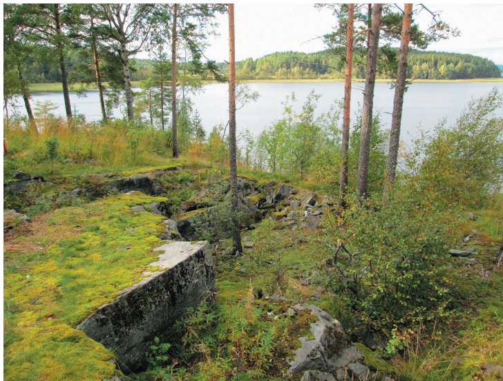
Fig. 4. Serdobol granite quarries at Parola Ryc. 4. Kamieniołomy granitu serdobolskiego w Parola

for transportation in the late 1930s, stayed on the lake shore until 1992. As Parola granite quarries are small and remote, they are seldom visited by tourists.