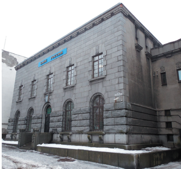
Fig. 3. Former bank of Finland in Sortavala built of Serdobol granit

Ryc. 3. Budynek dawnego banku Finlandii zbudowany z granitu serdobolskiego