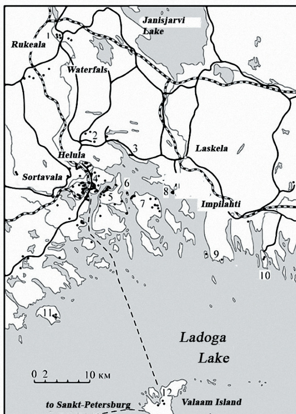
Fig. 1. Building stone quarries in the northern Lake Ladoga area; 1 – Ruskeala, 2 – Orjatlahti, 3 – Kirjavalahiti, 4 – Sortavala, 5 – Riekkalansaari, 6 – Vannisensaari, 7 – Tulolansaari, 8 – Juven (Kalkkisaari), 9 – Impiniemi, 10 – Syskyänsaari, 11 – Putsaari, 12 – Valaam (Borisov, 2002)

Sortavala Archipelago islands consist dominantly of metamorphosed folded terrigenous rocks (Ladoga series, Lower Proterozoic, Kalevian: 1.95–1.83 Ga) such as quartzitic sandstone, quartzite, various crystalline schists, gneisses and granite gneisses. The rocks are either exposed on the earth surface or are overlain by a thin discontinuous unconsolidated Quaternary sedimentary cover (Bulach et al., 2002).