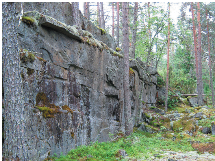
Fig. 6. Old working on Tulolansaari Island Ryc. 6. Stare wyrobisko na wyspie Tulolansaari

About 15 semi-trenches, 5 to 100 m 2 in area and 1–4 m in depth (Ruotsenkallio-2 workings), which form a distinctive terraced relief (fig. 6), were made 800 m east