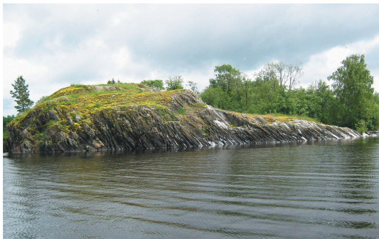
Fig. 7. Juven Island on Lake Ladoga