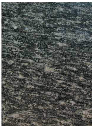
Fig. 2. Serdobol granite Ryc. 2. Granit serdobolski

Six workings, occurring as trenches and semi-trenches, 10–100 m 2 in length and 1.5–3 m in depth, in which about 450 m 3 of building and memorial stone (Serdobol granite) were produced in the 1920–1930s, were found on the east shore of Riekkalansaari, in a small area, 50 × 100 m 2 , at Parola ecosite. The workings are now covered by forest like shown in fig. 4. Piles of granite blocks, prepared by Finns