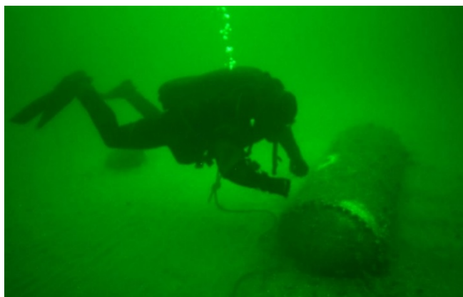
Figure 7. Clearance diver during mine identification and a mine as seen in the underwater vehicle's camera ROV t. „Ukwiał”.

Procedure's is consistent with the mine methods "minehuntingu" and, in general process involves sequential steps Four: