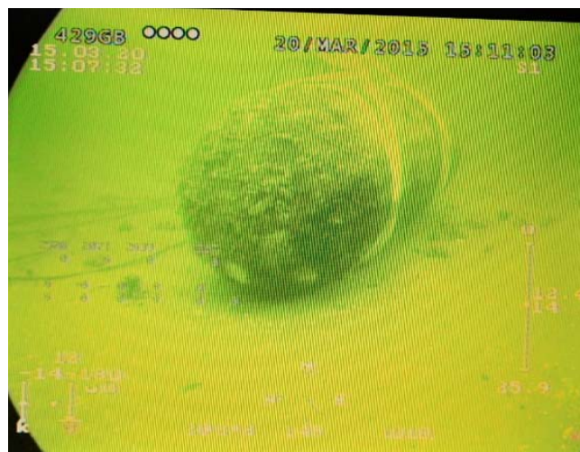
Figure 8. Clearance diver during mine identification and a mine as seen in the underwater vehicle's camera ROV t. „Ukwiał”.

In the direct proximity of the port of Gdynia (about 200 meters from the breakwater) as well as in the port (by the Silesian Waterfront) an English MK-VI mine and four German mines were detected (identified later as the GC-1 and GC-2 mines).