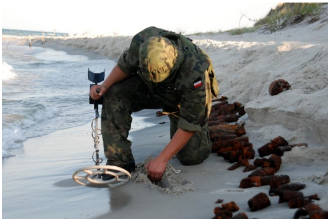
Figure 1. The Polish Navy sappers during anti-mine operations

Appropriate number and proper localization of the mine clearance patrols is crucial to establishing quick and effective response to various threats (Fig. 1 and Fig. 2). Relevant regulations determine that the response time should be no longer than 72 hours (24 in the case of an imminent and sudden danger).