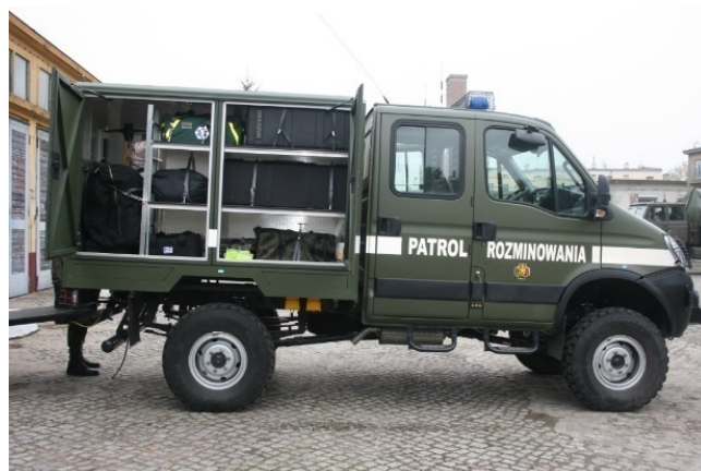
Figure 6. Mine clearance vehicle TOPOLA and other cars and trailers used as means of transporting unexploded.

The Navy's anti-mine patrols are responsible for seashore areas, the Hel Peninsula, the Polish naval ports and other military areas assigned to the Navy.