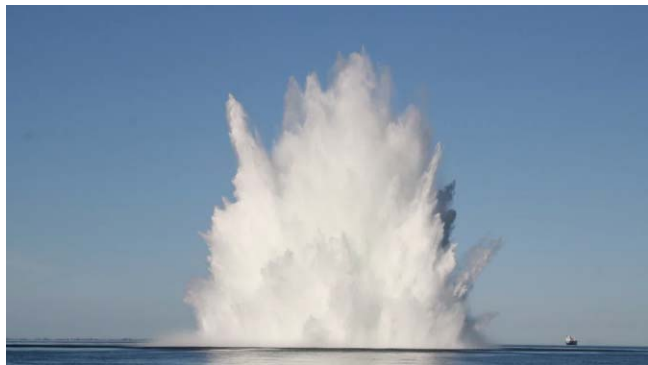
Figure 10. Mk VI, II World War mine extraction, conducted by a mine destroyer (March 2015), GC type mine found in The Gdansk detonation

These mines are considered especially dangerous, due to their size and the amount of explosive material they contain. For that reason a decision was made to dispose of them via the detonation method.