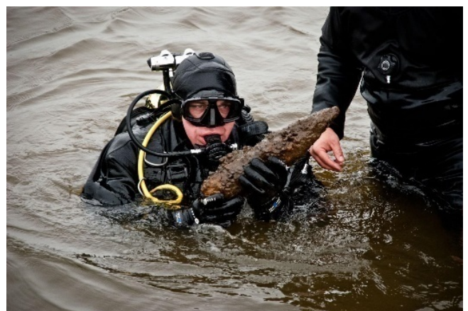
Figure 3. The Polish Navy divers during anti-mine operations

Most frequently, their task is to dispose of the Second World War remnants such as mines, torpedoes, bombs or artillery shells. In the recent year, the Navy's forces intervened, among others, in Świnoujście (on the construction site of the LNG terminal) [17], cleared the beaches near Kołobrzeg (Fig. 3 and Fig. 4).