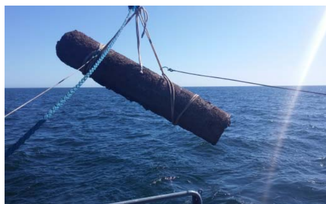
Figure 9. Mk VI, II World War mine extraction, conducted by a mine destroyer (March 2015), GC type mine found in The Gdansk detonation

The methods of disposing of underwater unexploded ordnance detected on seabed, classified and identified are as follows: