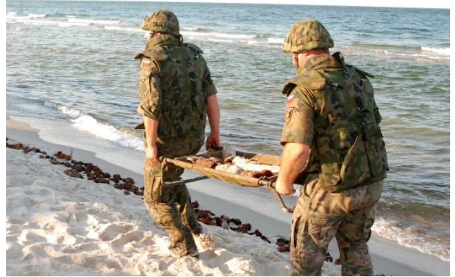
Figure 2. The Polish Navy sappers during anti-mine operations

The EOD divers and sappers of the Polish Navy, as well as the crews of the specialized minehunters and minesweepers vessels, take part in a couple hundred interventions annually. They operate mainly on the sea areas stretching as far as to the border of the Polish Exclusive Economic Zone [15], but also along the Polish coast [16] and in the inland waters of various Polish regions.