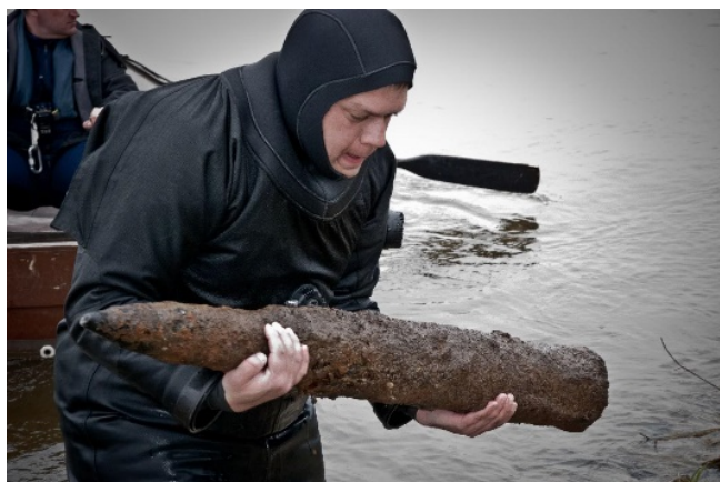
Figure 4. The Polish Navy divers during anti-mine operations

Every year, the Navy's mine clearance patrols, EOD Diving Groups, minehunters and minesweepers conduct c.a. 300 interventions either on land or on the Baltic Sea, neutralizing miscellaneous threats including (but not limited to) bombs, artillery shells, torpedoes, mines or other objects of military origin that could pose threat to lives or well-being of the country's and sea's inhabitants.