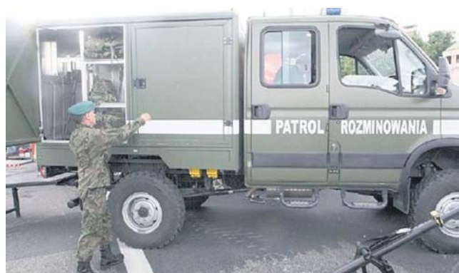
Figure 5. Mine clearance vehicle TOPOLA and other cars and trailers used as means of transporting unexploded.

The patrol consists of soldiers that are specialists in explosive materials. They are carefully selected, experienced, disciplined and well educated. Moreover, they are also prepared to lecture both adults and children on how to properly behave after spotting a dangerous device. Every anti-mine patrol is equipped with specialized detecting tools, means of transport and neutralizing unexploded ordnance, as well as protective gear (Fig. 5 and Fig. 6). The nature of their action is strictly interventional and focuses mainly on neutralizing explosive ordnance of military origin previously reported by the state or local institutions. All ordnance must be disposed of not later than 72 hours after being reported (regular intervention). If the object is particularly dangerous due to its localization (public places, schools, roads, construction sites), the time is shortened to 24 hours (urgent intervention). Responsible for securing the area until the patrol's arrival are the police.