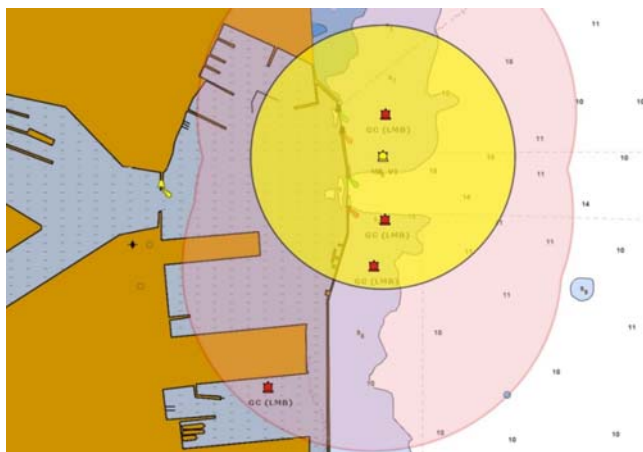
Figure 12. The GC-type mines (marked red) and the Mk VI mine (yellow) detected in the port pictured alongside the safety zones.

The disposal of the threat, conducted by the Polish Navy's forces, was the most fragile and dangerous element. It was crucial to ensure safety of the action during the extraction of the ordnance and later, during its destruction.