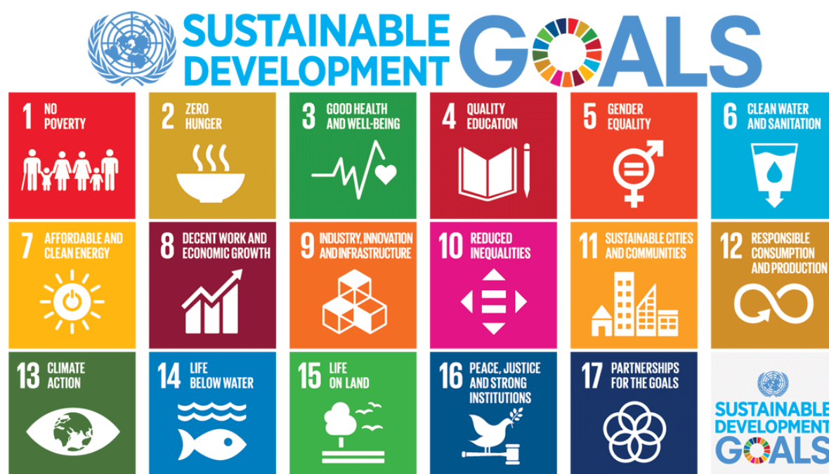
Fig.1.Sustainable Development Goals [36]

In 2000, the eight Millennium Development Goals (MDGs) were established. The headline target was the improvement of health, poverty, gender and social aspects. Nevertheless, the focus was on the environmental sustainability [32]. It was discussed at the Conference on Sustainable Development (Rio Earth Summit 2012). In consequence, it led to improved and extended Sustainable Development Goals (SDGs) [3,33,34]. In 2015, Agenda 2030 for sustainable development has been established, leading to better human life and ecosystem quality. The seventeen SDGs (including 169 targets and 230 indicators [35]) should be realized to 2030. The goals, listed in the Figure 1, are a roadmap and a call for all countries all over the world to the sustainable decisions and actions [35,36]. Notably, each aim has an environmental context.