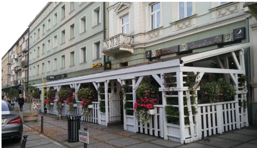
Fig. 1. A café garden on the Avenue of the Blessed Virgin Mary. The random aesthetics of the place maintains the diversity of urban life through the offer for various social groups

Restaurants and cafes located along the Avenue of the Blessed Virgin Mary use the wide pedestrian spaces to create so-called cafe gardens. They are a form of street furnishing. Their aesthetic is random, which introduces chaos to the street space. At the same time, it is an excellent example of the diversity and vital capabilities of the city (Figs. 1 and 2).