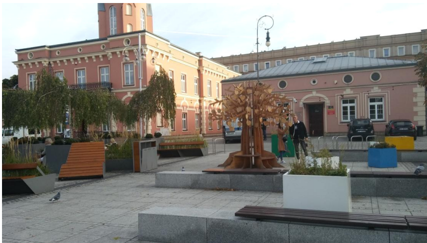
Fig. 3. Bieganski Square. An important element of the public space is the design of small architectural forms such as seats and greenery

enriching the urban space. An example of how a city square can use elements of street furniture to create a shared urban space.