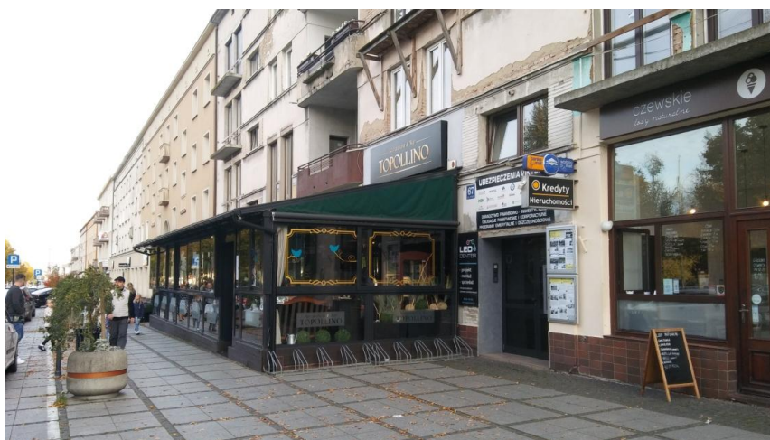
Fig. 2. A café garden the Avenue of the Blessed Virgin Mary. The built-up form of the premises enlarges the space of the café while introducing a cubature object to the street space