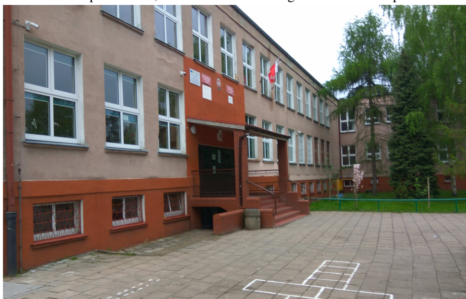
Phot. 1. Western elevation of the school building - main entrance.

Voivodship. The body of the object is built on the plan of several rectangles adjacent to each other and is located on the edge of its plot. It is a two-storey building with basements under its larger part. In the building there are classrooms, social and office facilities, a canteen, a common room, a gym and a company flat. The building was built using traditional full brick technology. The technical condition of the whole building has been assessed as satisfactory. The main entrance to the school is on the western side. Apart from the building, there are also sports fields, an athletics track and green areas in the plot.