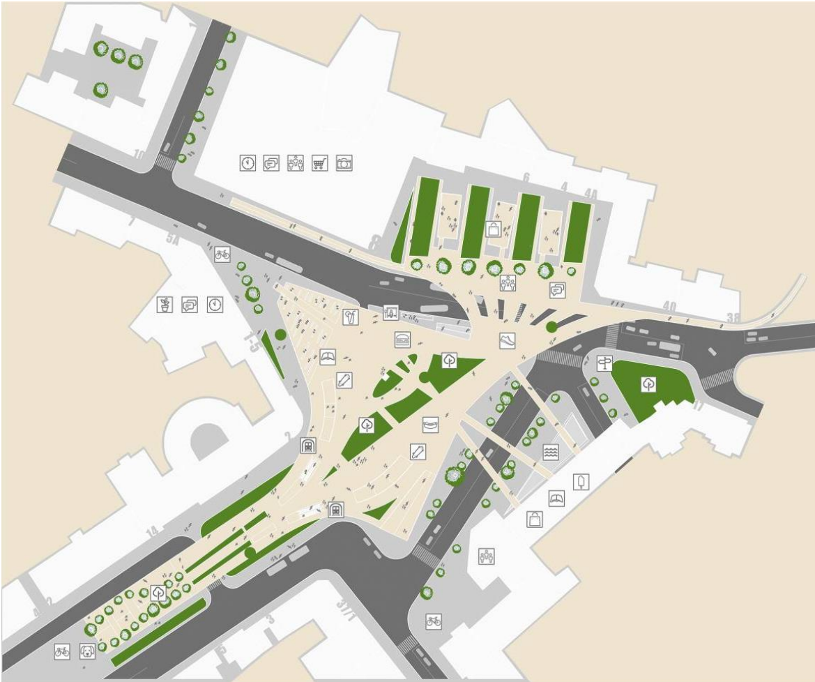
Fig. 6. First level of Lvivska square in Kyiv, Ukraine. Project. Author plan

The figure also shows that the rise of the first level of this square is very insignificant (only 5 meters) compared with the height of the buildings surrounding it (from 26 to 94 meters). This does not spoil image of the city and does not create the impression of being detached from the ground. The entire space of the square is organically integrated into the environment.