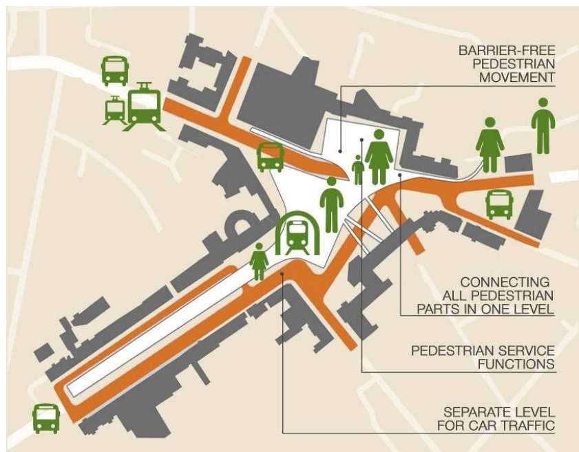
Fig. 4. First level of Lvivska square in Kyiv, Ukraine. Project. Author basic scheme.

For the safety of being in an open city space, a pedestrian needs an easy and accessible orientation in space with the help of signs, a visual communication system between city open spaces, illumination of space at nighttime and clear guidelines for movement in space (Lynch K.A., 1982).