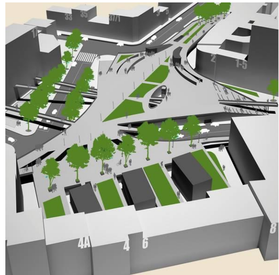
Fig. 9. Bird's-eye view from North of Lvivska square in Kyiv, Ukraine. Project. Author scheme.