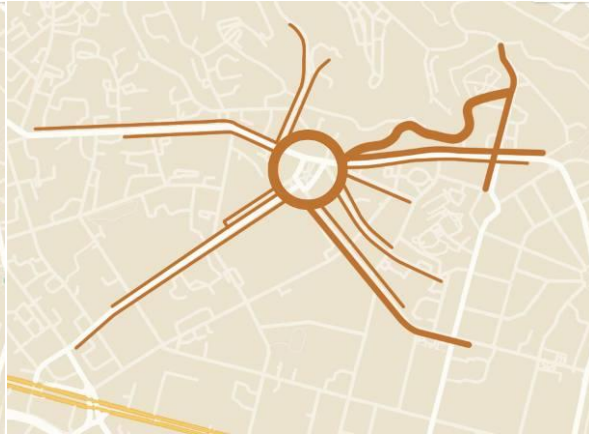
Fig. 2. Main pedestrian flows of Lvivska square in central part of Kyiv, Ukraine. Author basic scheme.

The square is situated at the interjunction of many streets and pedestrian ways. Junction of such streets as Yaroslaviv Val, Velyka Zhytomyrska, Bulvarno-Kudryavska, Stritenska, Reytarska and Voznesenskiy descent from the territory of square (Fig.1). All of them are very important city transport routes despite the fact that they are old and narrow streets. Also, Lvivska square is interjunction of pedestrian ways from Peyzazhnaya alley and Andriyivskyy descent to Peremohy, Sofiyivska, Mykhaylivska squares and the main public space not only of Kyiv but of all country – Independence square (Fig.2). Superimposition of all pedestrian and car flows makes the public space of this square very intense and extremely disorganized.