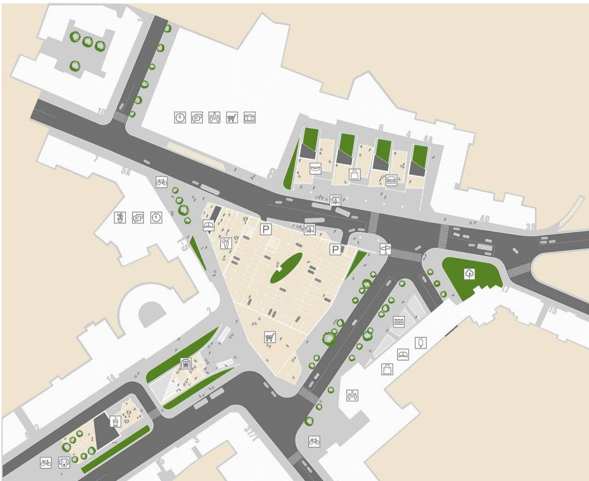
Fig. 5. Ground level of Lvivska square in Kyiv, Ukraine. Project. Author plan

The places already historically famous all around the world are the sign of their place itself (Czekiel-Świtalska E., 2008). Any architecture does not exist outside the place. And this is always a specific, definite place - it has not only objective and fixed parameters, the presence or absence of history, but also a personal character, a spirit that can only be felt. Architect's special sensitivity and attention to the specifics of a particular place, to its landscape, cultural, historical, social and other contexts are required.