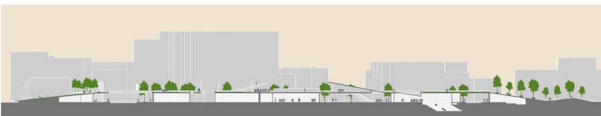
Fig. 7. Section of Lvivska square in Kyiv, Ukraine. Project. Author section