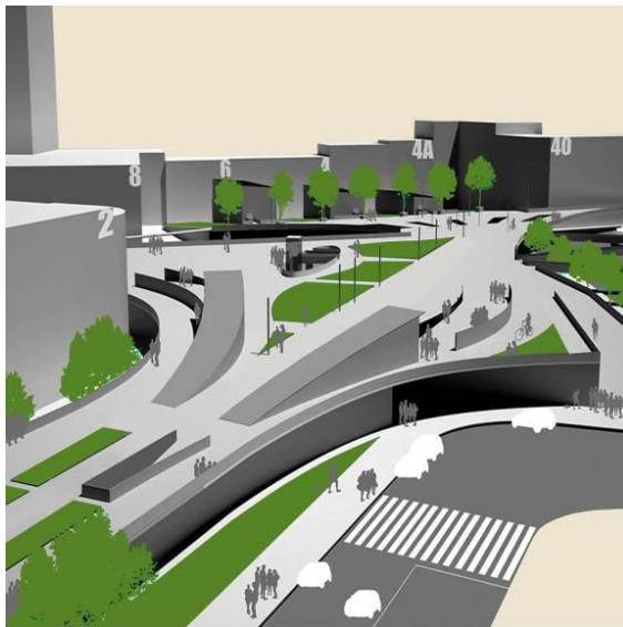
Fig. 8. Bird's-eye view from south of Lvivska square in Kyiv, Ukraine. Project. Author scheme.

All the vertical communications – stairs, elevators, lifts and ramps are also shown on the figure. In the center of the square, there is an oval light well - it illuminates the parking zone at ground level with natural light and makes this space more safe and comfortable.