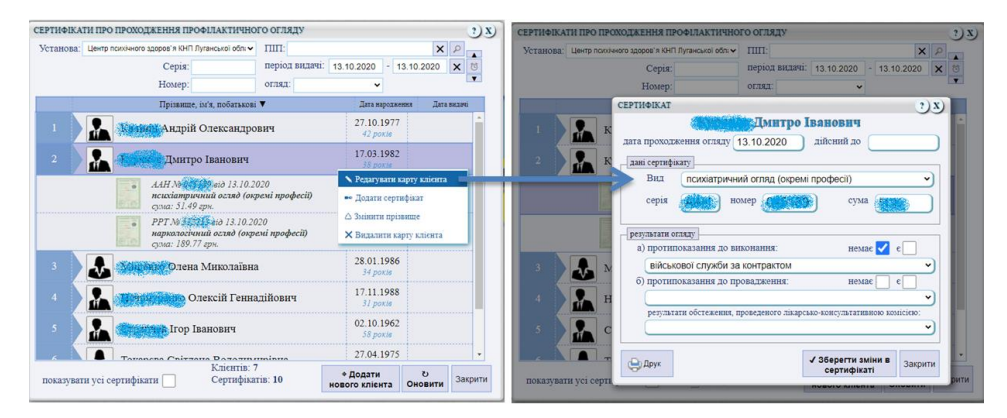
Fig. 6. Result of generating a certificate database form with filled data

In Fig. 6 shows the result of generating a certificate base form with filled data. The JSON object received from the server was converted into form parameters: into a two-level table with a client base and a list of certificates belonging to individuals; to the assigned callback functions for the context menu events for selecting clients and working with certificates; to general information about the number of certificates for a given filter. When the client card editing item is selected, a new form with AJAX loading of client data from the server is generated.