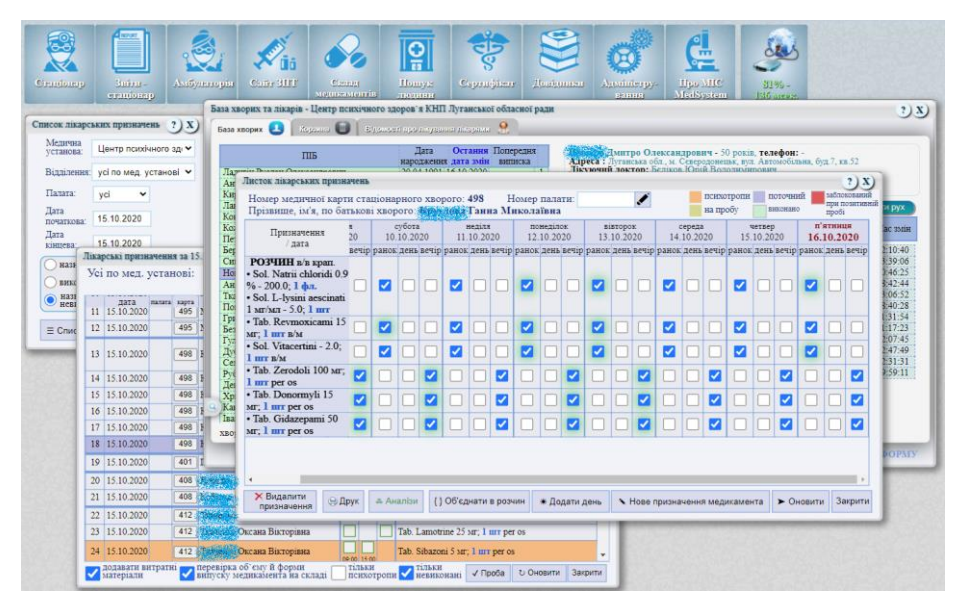
Fig. 7. Medical information system MedSystem

The practical implementation of the module model with the implementation of the dispatcher and the interactive window interface is represented by the installation in the form of the medical information system MedSystem being developed, in which the application modules are implemented in accordance with the considered interaction mechanism (Fig. 7).