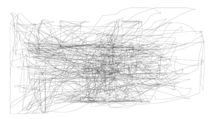
Fig. 1. The trace of a mouse cursor recorded during one hour of activity.