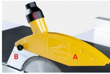
Fig. 5. The guard wedge (A), the split wedge (B) and the suction head (C)