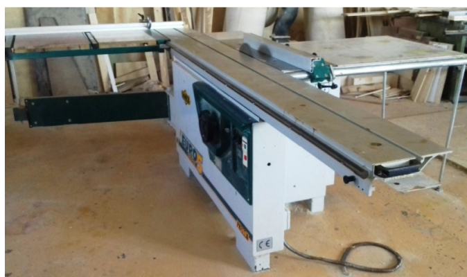
Fig. 1. Formatting circular saw PK 315A

As a machine safety examination we have selected machine PK 315A type circular saw (Fig.1). The circular saw is one of the most widespread devices for mechanical woodcutting. Selected circular saw have in the wood processing workshop an important functions in the form of very precise cutting of materials and the creation of transverse or sloping cuts with manual workpiece displacement.