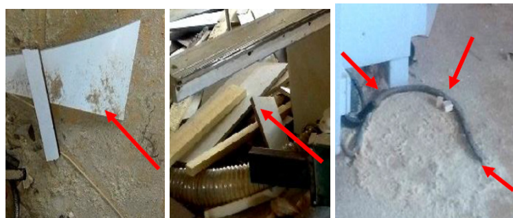
Fig. 4. Waste material and obstacles on the floor near the machine

The production organization is required to provide every employee with regular, understandable and demonstrable instructions related to the principles of safe work, health and safety at work, principles of safe workplace behaviour and safe working practices and to verify their knowledge. Furthermore, the production organization is obliged to inform every employee of the existing and foreseeable dangers and threats, with the possible impacts they may have on health and the protection against them.