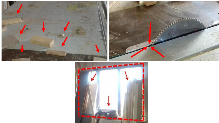
Fig. 3. Machine working table with waste material, missing splintering wedge, material in the place of windows.