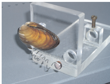
Photo 2. Mussels with measurement probes