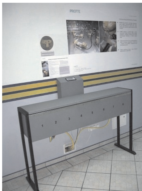
Photo 1. Aquarium with mussels