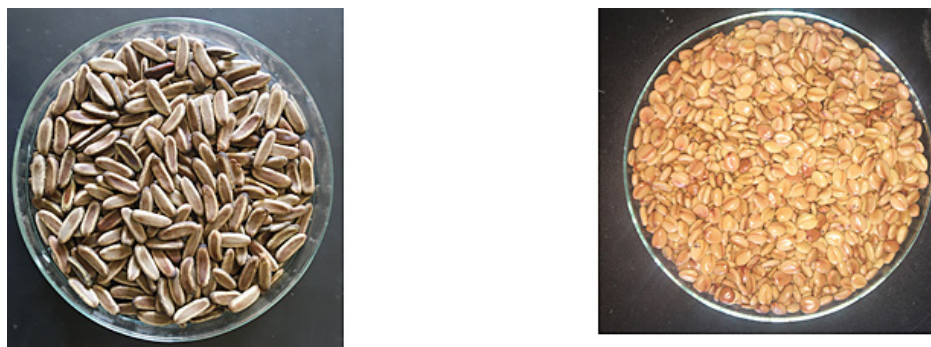
Figure 2. Delonix regia seeds (a), and Cassia fistula seeds (b)

to identify the resulted fatty acid methyl esters (FAMES).