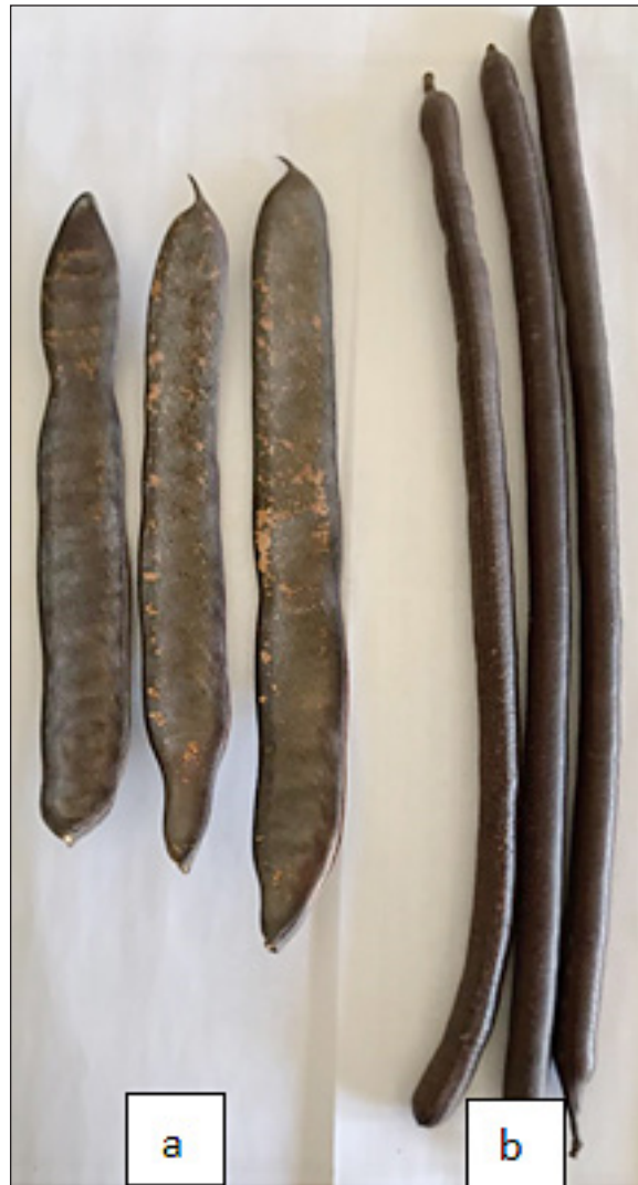
Figure 1. Delonix regia pods (a), and Cassia fistula pods (b)

Lipid Extraction and Methylation: By using the Soxhlet extraction method, the Petroleum ether (82.2 g/Mol, 80°C) was applied to extract the oil from the dried, powdered seeds, which was then concentrated using a rotary evaporator. A methanol/acetyl chloride solution was used to trans methylate about 50 \mu\text{L} of each sample of the extracted oil, as used by Masood et al. , 2005. Then, the Gas chromatography (GC) was used