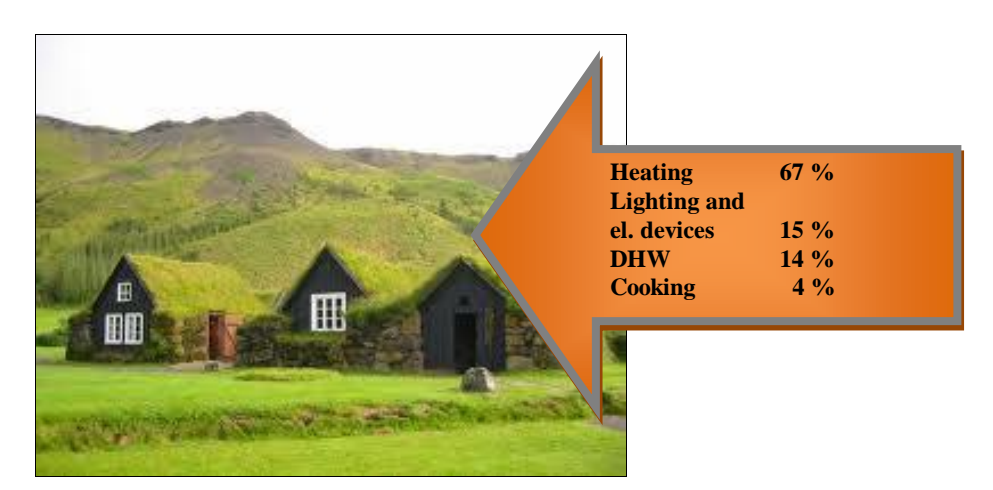
Fig. 1. Share of energy to house needs

While it is possible to save nearly 80% of the total energy in buildings with very low power consumption only through design and construction proposal, real estate market is still limited. In Europe, there has been only built a total of 20 000 lowenergy buildings, of which about 17 000 are located in Germany and Austria [5]. Figure 1 shows the approximate percentage distribution of total energy consumption of house operations.