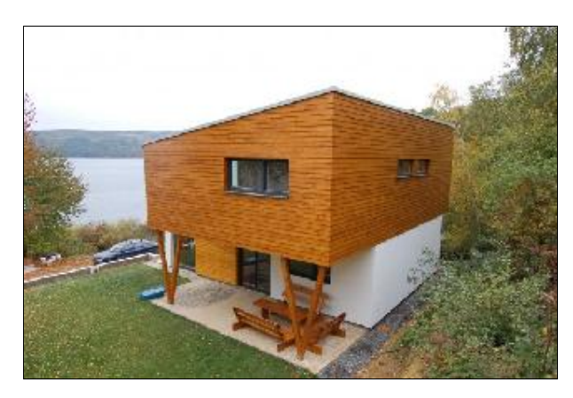
Fig. 3. Model of LEB house provided by Nízkoenergetické stavby s.r.o [13]

They are providing in their houses improved thermal insulation materials, design of low energy consumption, precision of construction with minimal dimensional tolerances, dry methods of construction without exclusion of moisture and climate regulatory action on wooden based, higher utility (residential) area reached by lower wall thickness with keeping all the static and thermal performance, eco-construction, where the main material is wood, and where by the keeping of all the technological processes, the life is comparable to a brick building [13] (table 8). There is shown in Table 8 a comparison of the savings before and after reconstruction to LEB standard and the Figure 3 shows a model of LEB house that is free for available client visits.