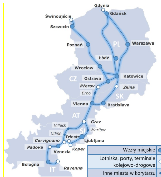
Figure 1. The course of the Baltic-Adriatic corridor.

In the area of corridor there are a total of 13 urban nodes and airports, 10 ports and nearly 24 active rail and road terminals (Bodewig, 2016, p. 7). It is built on the basis of the Baltic-Adriatic transport axis, which is dominated by rail and road routes. One of the main drawbacks of the corridor is that it is one of the few corridors that does not include inland waterways, even if it connects to the core network of the TEN-T inland waterways on different sections. However, this situation may be changed due to the planned expansion of the inland waterway transport network in Moravia. On the other hand, one of the greatest advantages of the corridor is the large number of other corridors that cross it transversely. From north to south, in order, these are the following (Lijewski, 2003):