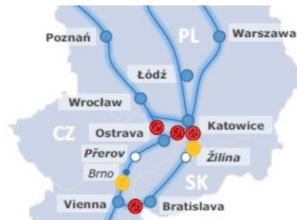
Figure 3. Location of cross-border transport bottlenecks in the Silesian Voivodeship. Source: https://ec.europa.eu/transport/themes/infrastructure/baltic-adriatic_en , 4.04.2019.