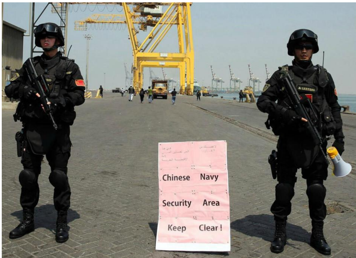
Fig 3. Chinese special forces soldiers, uniformed in a manner characteristic of the contingent operating in the Gulf of Aden, secure the waterfront at the temporary safe place in Djibouti

Two Yemeni ports located in a short distance from Djibouti were selected as boarding points from where the Chinese citizens were to be transported to the temporary safe place: the port of Aden and the port of Al-Hudaydah (the distance between the ports of Djibouti and Aden is 248 km, and between Djibouti and Al-Hudaydah 355 km). The location of boarding points in the coastal zones made it necessary to transport the evacuees by land, from the interior of the country, which could have a negative impact on their safety.