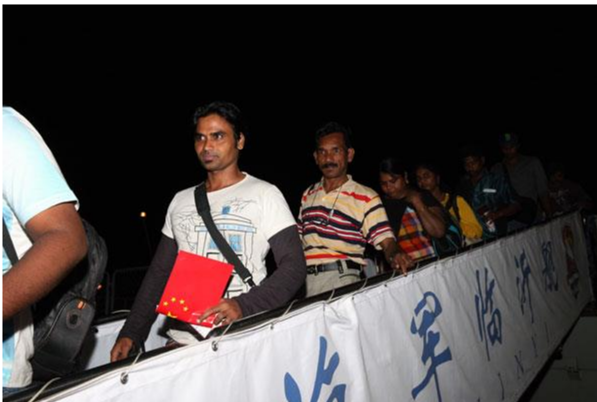
Fig. 7. Sri Lankan citizens disembark the Chinese ship at the port of Djibouti. 7 April 2015