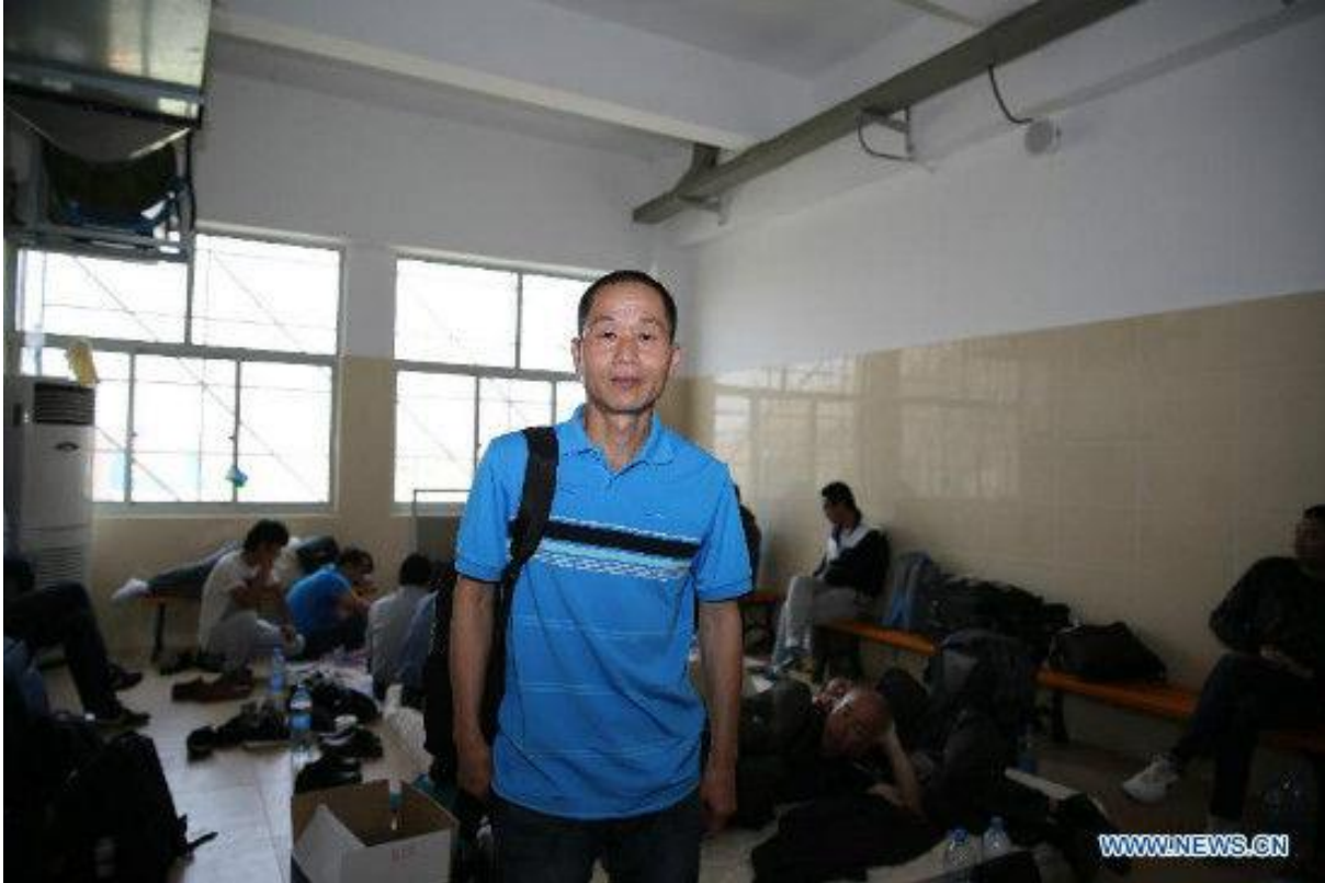
Fig 5. Evacuated Chinese citizens awaiting transfer to their country of origin. Djibouti 31 March 2015

In Djibouti, the evacuees were transported by coach to a temporary accommodation organized at the Stade du Ville football stadium, where they awaited for transfer to their country of origin by passenger planes 22 .