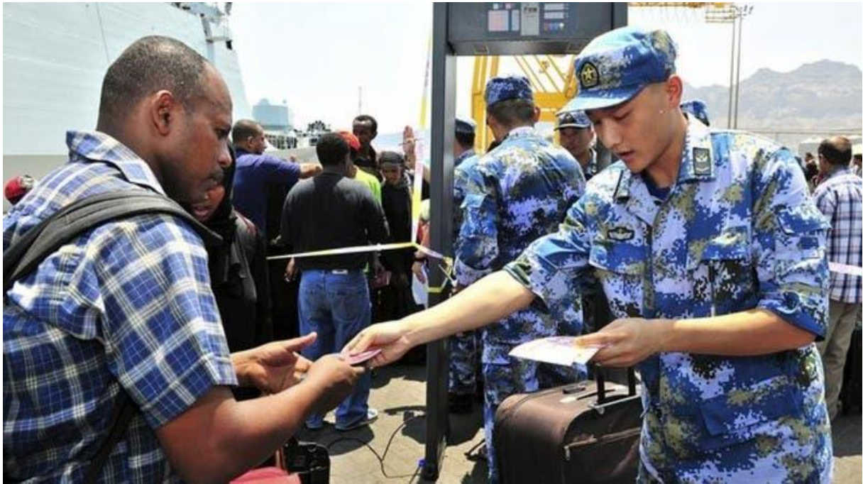
Fig 6. Security check organized by the Chinese Navy at the boarding point for evacuees. Aden port. 2 April 2015

While, as a rule, China is trying to ensure the continuity of its diplomatic missions even during hostilities, the further escalation of operations in Yemen forced the Chinese authorities to temporarily shut down the Chinese Embassy in Sanaa and the consulate in Aden. Subsequently, on 7 April 2015, in the fourth wave, the Chinese ship Linyi evacuated the remaining 38 Chinese citizens from Yemen, including 14 members of the diplomatic staff. Additionally, at the request of the Sri Lankan government, 45 Sri Lankans found shelter onboard the Chinese frigate 27 .