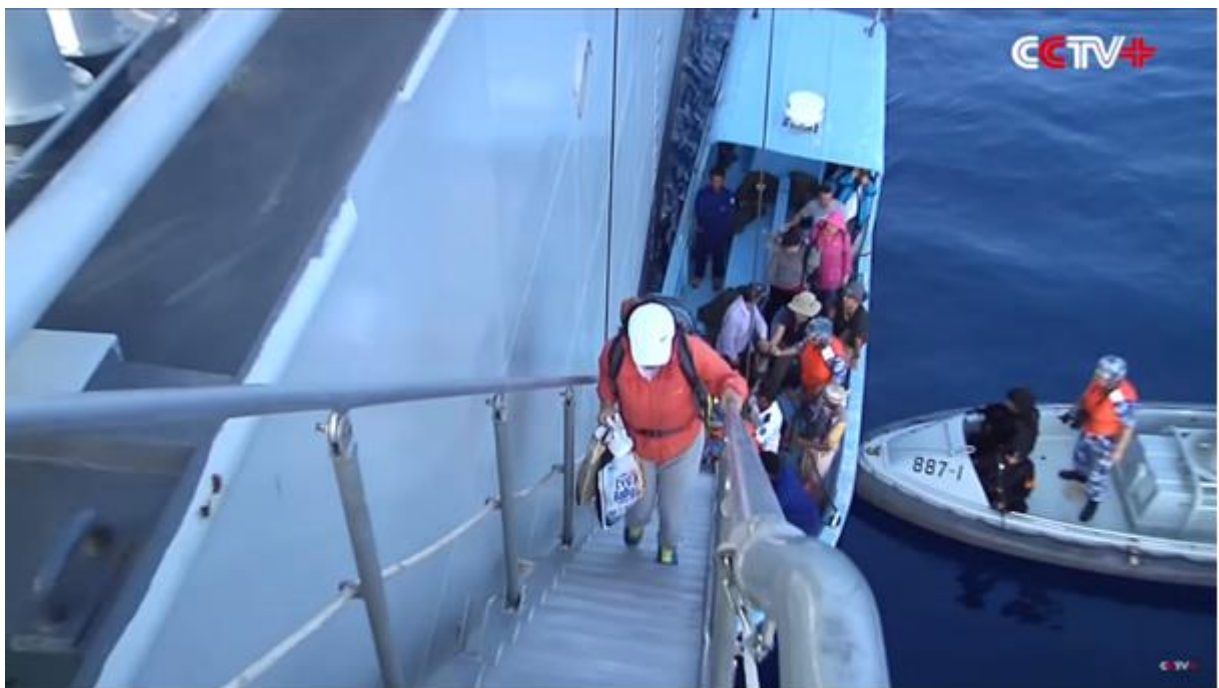
Fig. 8. Last Chinese citizens evacuated from Yemen on 7 April 2015 boarding the Weishanhu supply ship

According to official Chinese data, during the operation, between 29 March and 7 April 2015, 629 Chinese citizens and 279 foreigners were successfully evacuated. Throughout the operation, no 30 direct interaction of the fighting parties with the evacuated parties and the forces conducting the NEO operation was recorded.