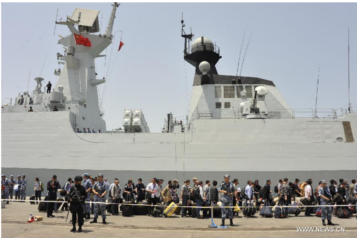
Fig. 4. Chinese citizens awaiting in line to board at the port of Aden. 2 April 2015

The execution phase began on 29 March 2015, when the first group of 122 Chinese citizens was evacuated from the port of Aden to the temporary safe place in Djibouti. A day later, the evacuation of another 449 Chinese citizens who, at that time, were employees of twelve Chinese enterprises operating in Sanaa, followed. In addition to Chinese citizens, the evacuated group also included eight foreigners employed by Chinese companies. The evacuees first took a five-hour journey from the evacuation point in Sanaa to the boarding place in Hudaydah by their own means of transport, or by buses organized by the embassy. There, they boarded the PRC Weifang frigate , and were then transported by sea to Djibouti 21 .