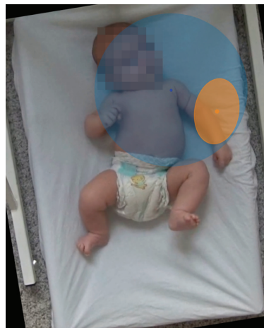
Fig. 3. The maximum range of movement for the left upper limb (blue circle) and the ellipse circumscribed about the example trajectory (orange). The FMA value was obtained by dividing the area of the ellipse circumscribing the trajectory by the area of the circle defining the maximum range of motion of the upper limb