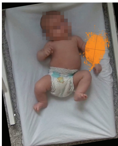
Fig. 2. Visualization of the short axis and the long axis of the ellipse describing the movement of the left upper limb. The FMS value was obtained by dividing the length of the short axis of the ellipse by the length of the long axis

CMA-v indicates the direction of up-down movement. A value of 0 determines the shoulder (upper limbs) and hip (lower limbs). Values above 0 indicate upward movement of the arms or legs, and a value of 1 is the maximum value of elevation of the upper or lower limbs. Values below 0 indicate downward movement of the arms or legs, and a value of -1 is the maximum value of lowering the upper or lower limbs.