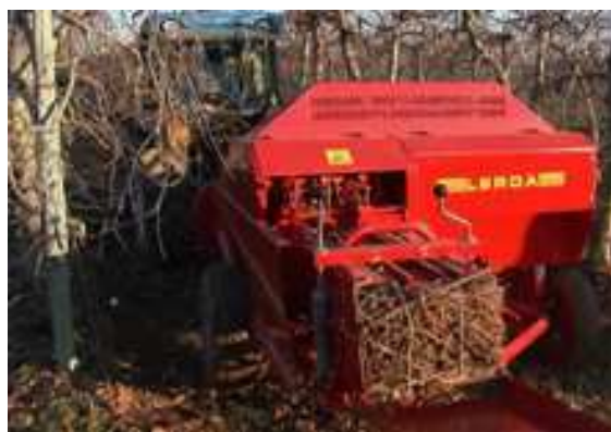
Fig. 1. Press LerdaT110 [14] Rys. 1. Prasa LerdaT110[14]

Currently in the world to gather the branches remaining in orchards and vineyards after the maintenance cuts conventional presses for straw harvesting are used, specially adapted for this purpose. The press Lerda T110 that produces rectangular bales with a volume of approximately 0.8 m 3 can be one such example (Fig. 1).