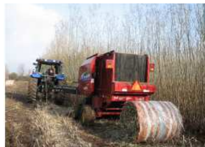
Fig. 3. Machine harvesting and pressing the branches based on the round baler New Holland BR 740 [7]

Machines which produce bales with a diameter of 1200 mm are also known. There are generally the hay-silage balers with variable or fixed chamber which are adapted for cutting trees and growing shrubs, such as willows and for pressing. As an example- the harvesting and pressing branches machine developed in Canada, based on round baler with variable chamber: New Holland BR 740 (Fig. 3).