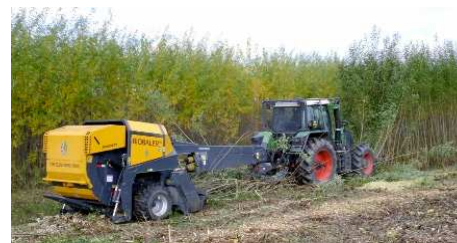
Fig. 4. BioBaler machine WB-55 [13]

A similar machine, also developed in Canada, is based on a fixed chamber round baler roller BioBaler WB55 (Fig. 4).