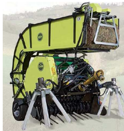
Fig. 2. Small baling press for branches Quickpower Company CAEB [15]

A small size bale is their main disadvantage. Also, the overall width of about 1500-1600 mm allows you to work without the use of additional scraping devices or make several trips in one row only in narrow inter-row. Both of these machines do not have high power demand, such as the press; it is Quickpower min. 15 kW.