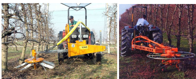
Fig. 5. Windrower for branches [16] Rys. 5. Zgarniacze gałęzi [16]

Analyzing presented machine it should be emphasized that in most cases the working width is equal to the working width of pick-up attachment and only baling press Quick-power has a rotary windrower to increase its working width from 1550 mm to 2300 mm. In case of use of these machines to harvest branches lying across the width of the inter-row, obviously these widths are insufficient. For this reason, the treatment pressing for wider spacing of trees should be preceded by amassing branches on the row in the middle of the inter-row spacing. This is done by using different kinds of rotary swathers (Fig. 5).