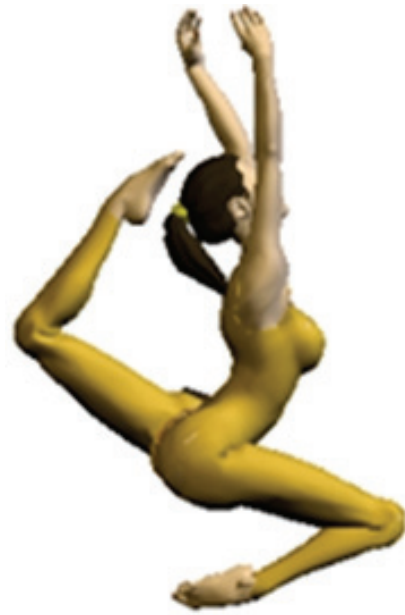
Fig. 1. Stag ring leap

According to the COP [18], its use does not impose the technique used during the preparatory phase on condition that it could create a single and clearly visible image of a fixed and well-defined shape during the flight rather than two different images and shapes [18].