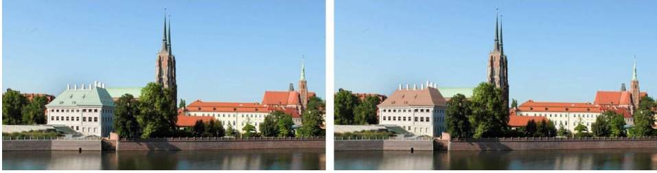
Fig. 3, Fig. 4 Photomontages made of the photos of a fragment of Ostrów Tumski (MR)