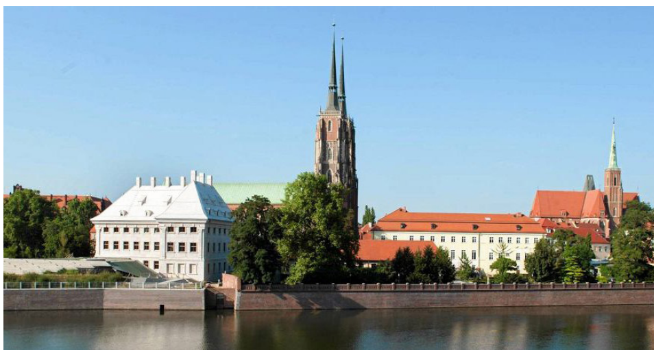
Fig.1 The view of a fragment of Ostrów Tumski in Wrocław with the newly erected building of the Archdiocesan Library