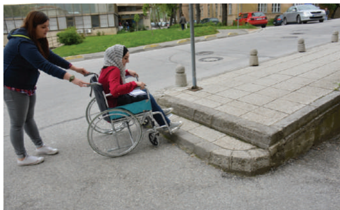
Fig. 2. Participants encountering various types of physical barriers while navigating around the Clinical Center campus