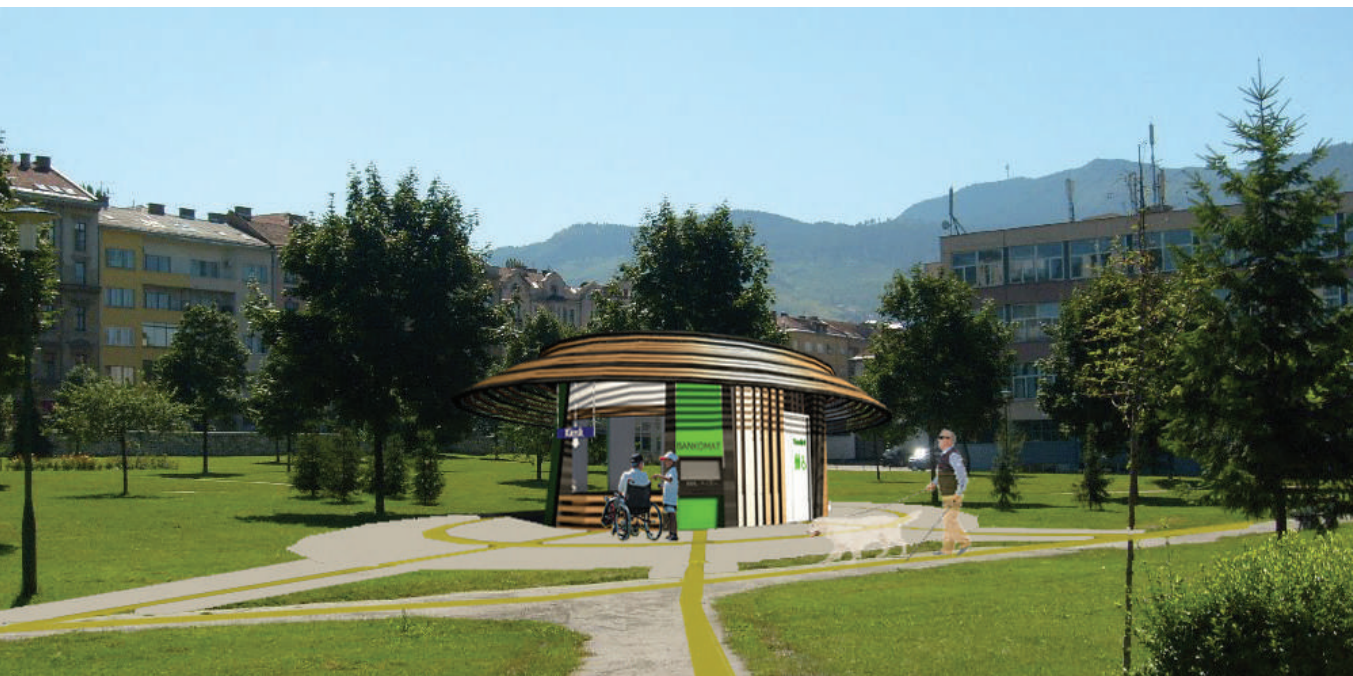
Figure 4: Universal kiosk. Authors: E. Guven, O. F. Mukul Mentor: T. Tufek-Memisevic

disabilities, in addition to space constraints, are also subject to outdoor time constraints, mostly due to the lack of accessible public restrooms.