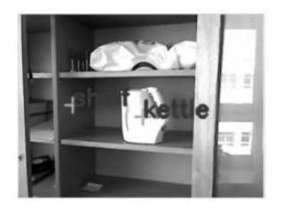
Fig. 8. Objects detected and signalized by the system.