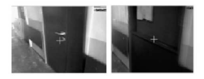
Fig. 4. Deference between notice board and door office is small and hard to distinguish with touch.

Locating appropriate door in a room is also a challenge for a blind person. The task is even more complicated when the blind person is moving across the hall. Without our system blind person is forced to count the doors. However, as it can be noticed (see Fig. 4) there are also notice boards in the hall, which look like doors. Recognizing the notice board without the prior knowledge could be difficult, since door and board are of the same height and width and have characteristic wooden edge.