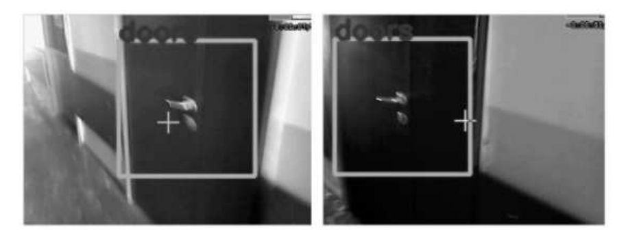
Fig. 5. Examples of properly detected doors.

This scenario aims at showing that the system can easily recognize the doors with computer vision techniques. Moreover, the system can count the doors itself and perform camera tracking for accurate camera position localization. At first, a door is detected. It can be noticed that door is detected even if the image is slightly blurred due to the camera motion. The notice board is not classified as door (neither from far nor from near). The result of the computer vision system detecting doors is presented in Figure 5, while no errors (no false positives) are presented in Figure 6.