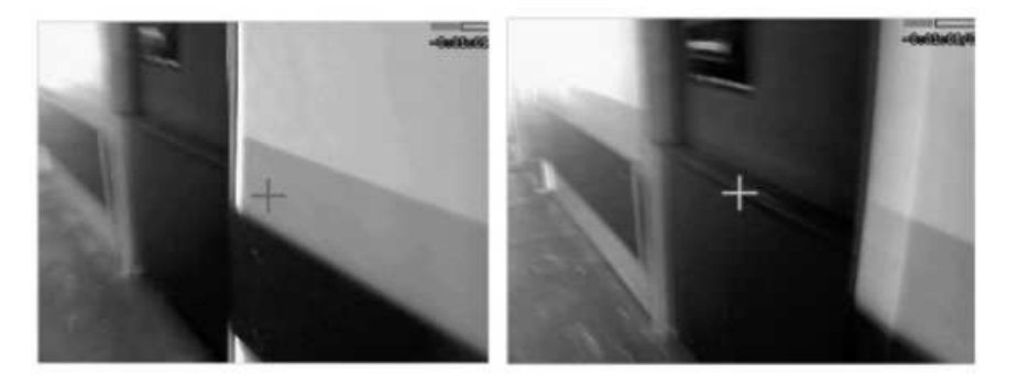
Fig. 6. No doors signalized by the system.