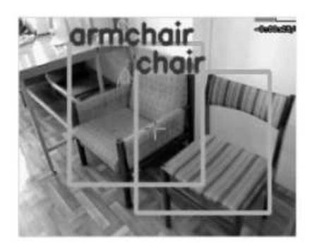
Fig. 2. Result of properly detected seats.