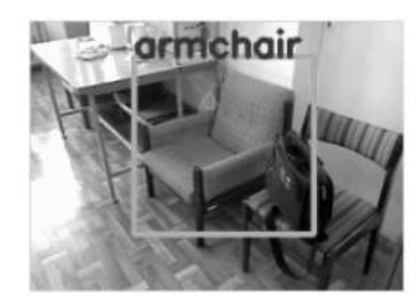
Fig. 3. Result of properly detected seat (and no occupied seat detected).

This scenario is a modification of the previous one. Now one of the seats is occupied. As the result, only one seat is suggested by the system. The occupied one is not signalized. The armchair standing on the left side is signalized as free. The result of the computer vision system detecting free seat with no false positive (occupied seat) is presented in Figure 3.