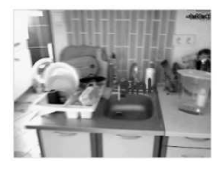
Fig. 7. The sink recognized by the system.