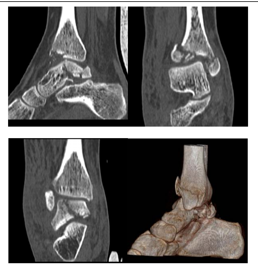
Fig.3 The same patient as on Fig.2. Postprocessed CT scans (sagittal, coronal and 3D VRT) – referring to Fig.2 notice higher number of fissures and intermediate fragments concerning tibia and talus

This study results and results of other authors' studies [1,8] are not comparable due to differences in patient prequalification (ex. age, trauma mechanism) and complex nature of bone fractures. However the most common fracture diagnosed in our study was supracondylar fracture of the humerus – 30% of all cases (n=7) and Alburger et al. also reports that type of fracture to be most common [1].