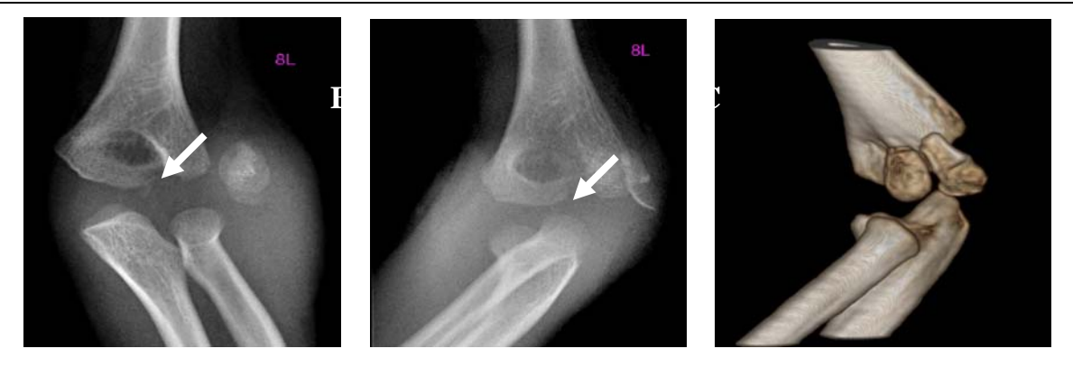
Fig.1 Six years old male patient. A,B- plain radiography shows oval shade (arrow) made of two displaced structures: capitulum of the humerus and lateral humeral epicondylus; C- 3D VRT clearly shows separated fragments of the humeral bone