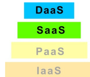
Fig. 2. Relationship pyramid of Cloud Computing models [9] Rys. 2. Piramida zależności pomiędzy modelami chmury obliczeniowej [9]

Therefore, moving the entire infrastructure (except the physical measuring machines) into the cloud could be a huge benefit. We would use only what we currently require to perform a specific task. There will be no need to buy a license for specialized programs for multiple stations, and most importantly, expensive computer equipment that until now has been necessary for the proper and smooth operation of the whole system.