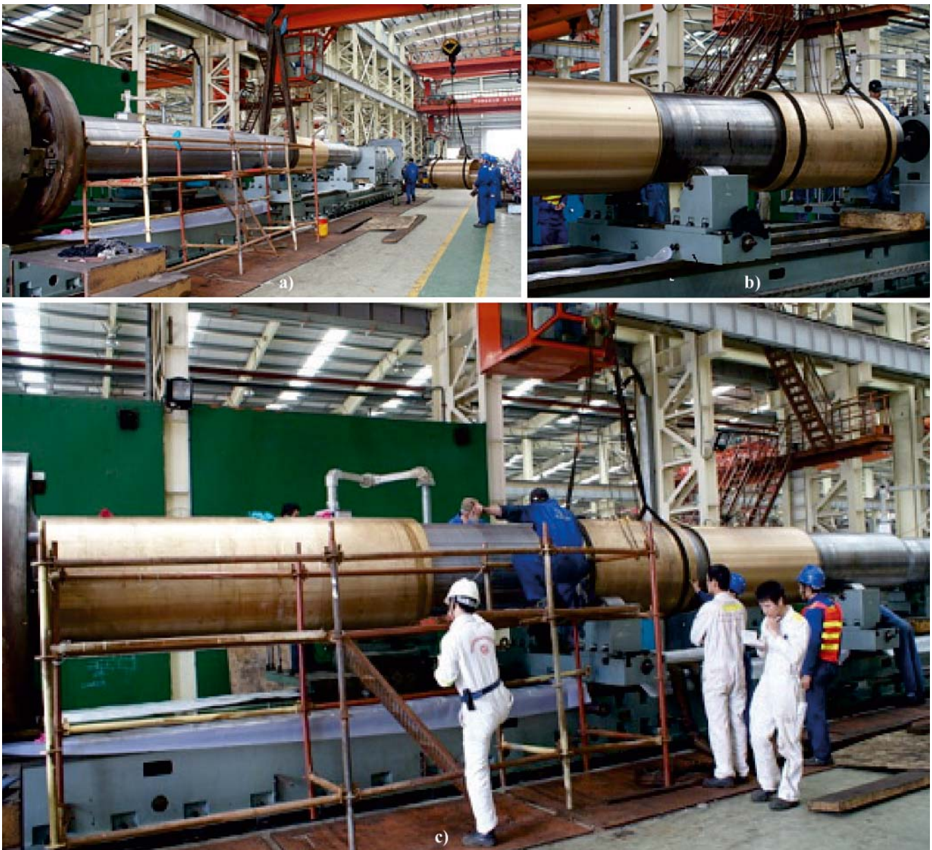
Fig. 6. Run of putting the particular sections of the bearing sleeve onto the shaft

the pouring space. This is necessary for supplementing void cavities resulting from a sealing foam elasticity, resin shrinkage during curing process, and other causes.