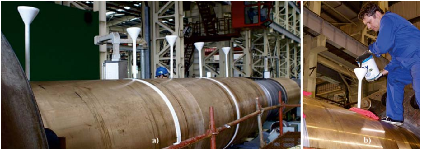
Fig. 7. a) the sleeve-shaft system prepared for pouring with resin compound, b) manner of pouring

were revealed. After ending the assembling work the sleeve surface were subjected to after-machining to remove the small surplus left.