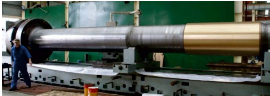
Fig. 1. The part of ship propulsion shaft, prepared for assembling the new bearing sleeve on it