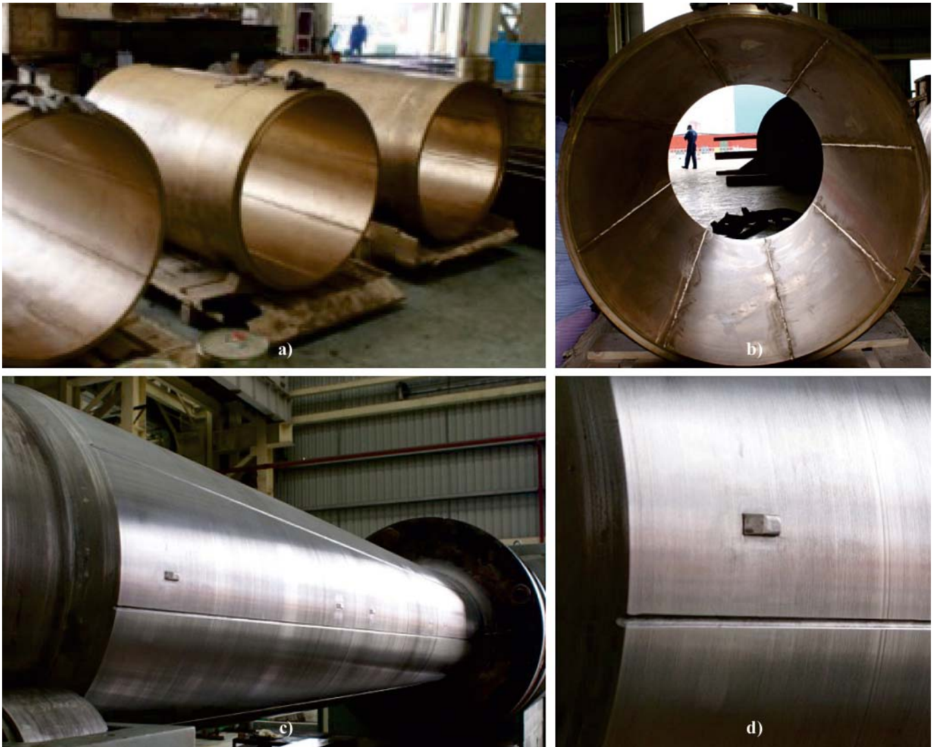
Fig. 5. Sections of the bearing sleeve and the shaft with cut splineways and welded spacing elements

elements with the use of resin compound there are many important details which may decide either on reaching success or suffering defeat in practical realization of such solutions.