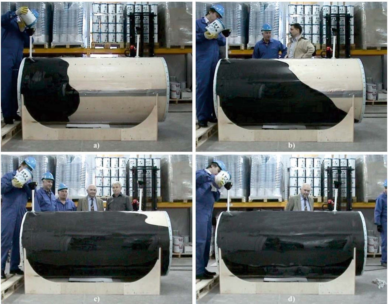
Fig. 4. Model tests of a manner and time of filling the pouring gap between shaft and sleeve with liquid EPY resin compound

factor values against shear and surface compression for the resin compound in regular ship operation conditions will be multifold greater than the above given ones calculated de facto for the situation of bearing failure when shaft rotation against bearing would be completely blocked. Such situations are completely unknown in practice.