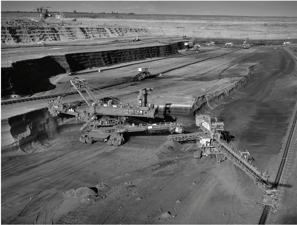
Fig. 1. Surface mining – Libouš mine Rys. 1. Kopalnia odkrywkowa - kopalnia Libouš