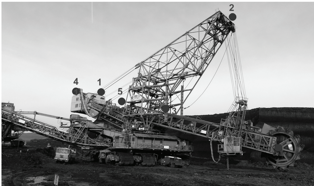
Fig. 2. K800/103 excavator Rys. 2. Koparka K800/103

A control unit controls the operation of the entire system. The position of the centre of the bucket wheel axis (Dot 6) is computed from X, Y, Z coordinates acquired from the GPS devices and on the basis of sensors' data (inclinations, rotation speeds) on a 5-second basis. Using radio-modems, the data is transmitted to the headquarters building of the Surveying and Geology Department, where it is saved. Then the data is processed by evaluation software (Kvas Prognosis Models). The system has been operated since December 2006.