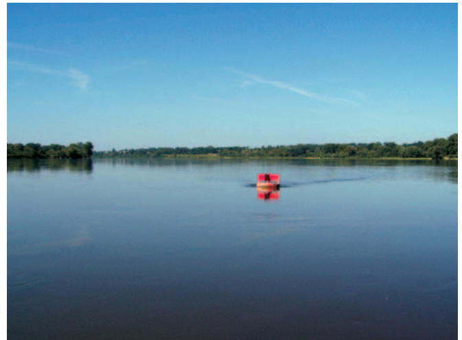
Fig. 4. A typical course of the Bug river- bed .

Floating objects should then reduce its speed.