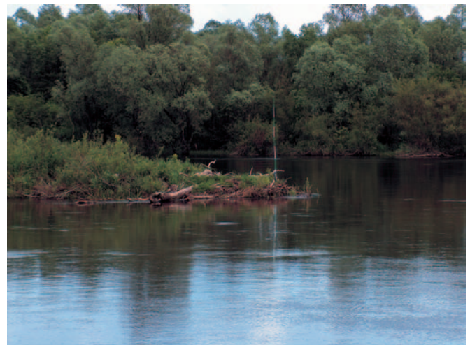
Fig. 5. Mark signing the cape of the island on the Bug waterway .

Though in the information materials [Informator 1961] the highest navigable water-level is given higher than the warning state, these authors have assumed that navigation will be continued only at the water-level contained within the river banks. Number of islands located in the main river-bed both of the Vistula and the Bug makes navigation at the higher water states more hazardous (Fig.5).