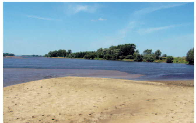
Fig. 2. Lateral transition of the stream-way towards the river bank .

Then in the central part of the river-bed systematic accumulation of tracted rubble starts to occur, gradually covering larger and larger part of the width of the bed's cross-section and shifting the flowing water together with a part of the rubble material towards the banks. Along with water-level sloping larger and larger areas of low sandy islands emerge and narrow and deep beds similar to "chutes" appear close to the banks. In some cases water inflow to a "chute" occurs laterally to the bank (Fig.2).