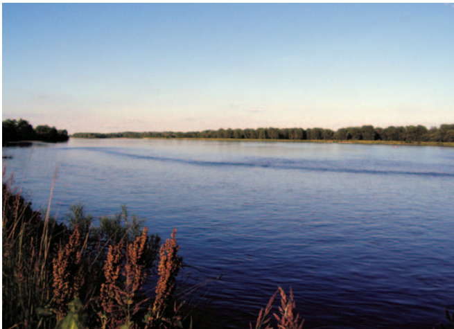
Fig. 3. The edge of the macro-fold along the firm river-bed section of the Vistula (Wisła).

can happen : the first when the central zone of the river-bed becomes shallow and the “chutes” at the banks appear, and the other when – in reverse – the zones near the banks become shallow and the deeper portions appear in the central zone of the river-bed. The bed’s morphology is generally similar to that in the situation with the dominating arm, described in 2).