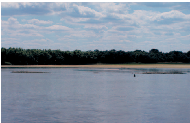
Fig. 1. Remainder of regulation infrastructure in the main stream-way of the Vistula (Wisła) .

Lack of funds for systematic overhauls, lasting 25 years, has led to devastation of bodies of longitudinal protecting groynes and almost complete destruction of most transverse repelling spurs, from which only small fragments remained. The buildings are not capable of stabilizing the main-stream position and improving navigation conditions, sometimes in reverse – their rests located in the main-stream constitute a serious hazard to shipping (Fig.1). Changes of the main stream-way position happen after every larger freshet as well as ice run-off.