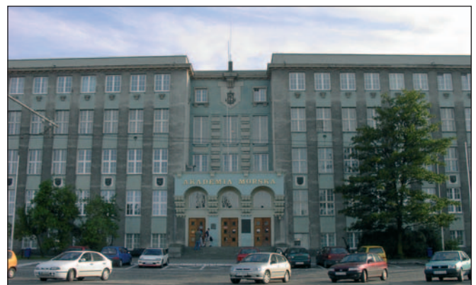
Main building of Gdynia Maritime University.