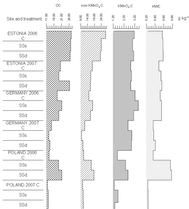
Fig. 1. Labile and non-labile organic carbon fractions in the soils studied

The content of organic carbon in the studied soil samples increased after application of sewage sludge in the first year in Germany and Poland. In Estonia, the amount of OC in control and amended plots was similar (Fig. 1). Nevertheless, it should be noted that organic carbon decreased by 20–30% in the second year after application of sewage sludge and the decrease affected also control soil samples.