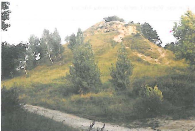
Fig. 2. The Lev Hill — outcrop of Upper Cretaceous and Upper Tortonian deposits abundant in fossils.