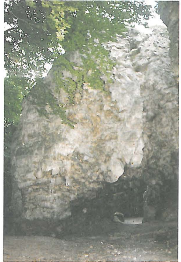
Fig. 3. Tchortova Skala (Hill) — sandstones and breccia of Upper Tortonian