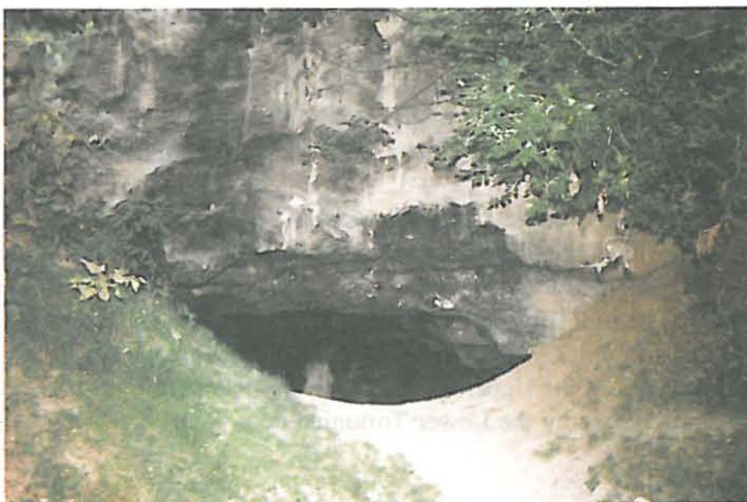
Fig. 4. The entrance to the Medova Cave within Upper Tortonian limestones

represented by sandstones of different density and granulometry with flint pebbles, lithothamnium swellings and pelecypoda shells; by the quartz fine-grained, oblique sands with fossilized trees; by sandy limestones with lithothamnium swellings and with interlayers filled with bivalvia shells (Danysh, 1987c). Sandy limestones form the well expressed structural terrace with juts of the Lev and Vysoky Zamok hills. Upward, the Upper Tortonian deposits are represented by quartz, by sandstones interlayered with benthonic clays and dense sandy limestone with numerous lithothamnium swellings and bivalvia shells.