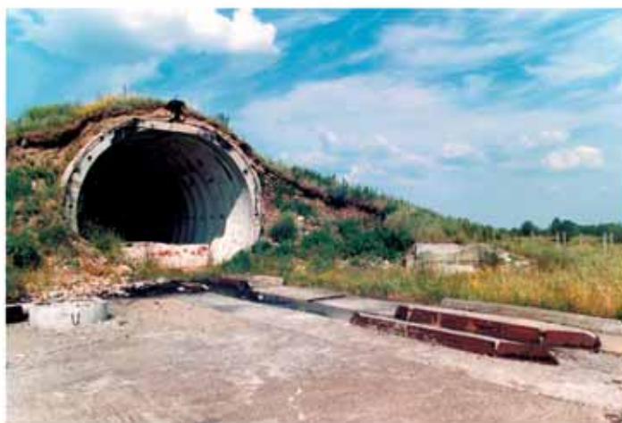
Fig. 5. A former Russian missile base at Keila-Joa attracts a great number of tourists visiting Tallinn