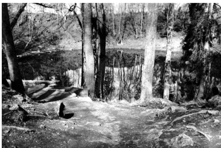
Fig. 3. Kaali meteorite craters were taken under nature protection already in 1938

Estonian geoscientists are actively participating in ProGEO (The European Association for the Conservation of