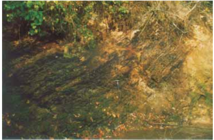
Fig. 3. The outcrop of the Menilite Fm. the Adyszów Stream, Monasterzec

The Węglówka Marl Fm. spans a part of the profile from the upper part of the Upper Cretaceous to Eocene. Thickness of this formation ranges from about 60 m in the Silesian Unit to more than 200 m in the Subsilesian Unit. These marls are developed as red, pink, grey-green, green and almost white calcareous shales and marls, with local phosphate and pyrite concretions, and accumulations of native copper and other copper minerals (Ostrowicki, 1958; Gruszczuk, Ostrowicki, 1961; Gruszczuk, 1958; Kita, Ostrowicki, 1959; Franus, Rajchel, 1999). The variegated shales are sediments about several tens of metres thick, with a diversified age in the two units ranging from Palaeocene, and even Maastrichtian, to Lower Eocene. They are developed usually as soft shales with intercalations of green shales, containing manganese and phosphate concretions and subordinate sandstone layers. The Menilite Fm. belongs to Oligocene; its thickness is about 100 m. The formation represents a lithologically diversified complex, with brownish siliceous-clayey shales as a dominant sediment. In their lower part, there are lensoidal insets of sandstones, in the upper part a series of brownish cherts and silicified marls, while in the remaining, essential part, thin intercalations of black shales, cherts and sandstones appear. The upper border of the Menilite Fm. with the Krosno Fm. is diachronic.