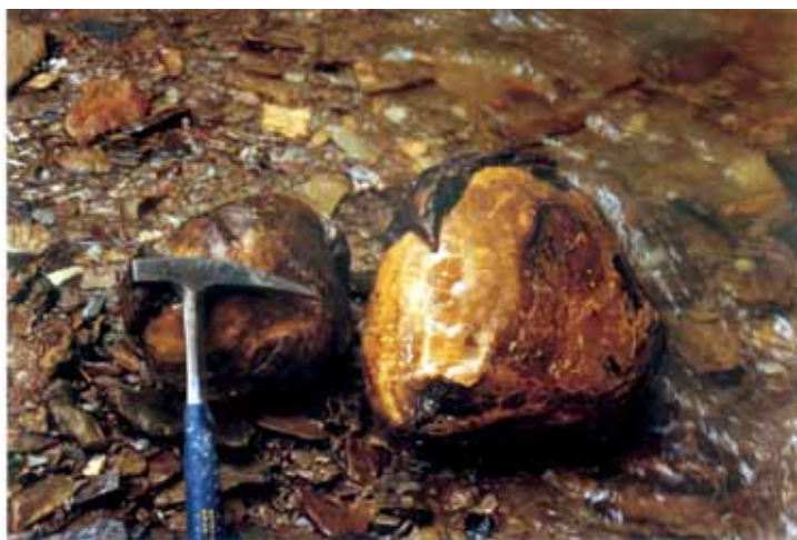
Fig. 5. Phosphate concretions in the Węglówka Marl Fm. (shales and marls) in the right tributary of the Wańkówka Stream, N of Olszanica