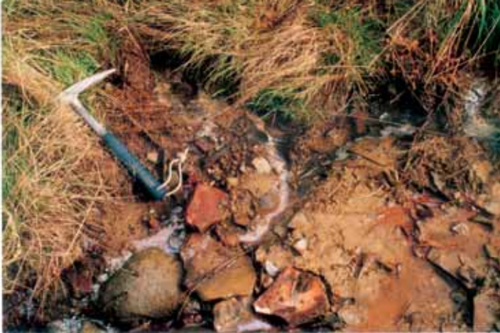
Fig. 7. A spring with the chloride type water in Tyrawa Solna

Another, currently filled up well, is situated further west, on the left bank of a stream, close to a field track lined with concrete slabs, about 200 m of the side tarmac road to Podczerniawa. According to written sources, the chloride springs of Tyrawa Solna were exploited for rock salt as early as 1435. Manufacturing of salt stopped in 1772 when the mining facilities were demolished by the Austrian administration in order to protect the state salt monopoly.