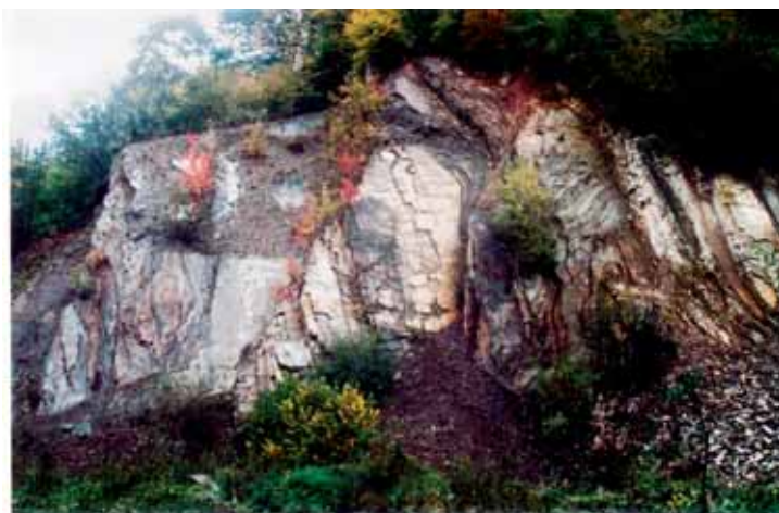
Fig. 4. A large scarp exposing the Menilite Fm. with the complex of the cherts and marls near Krościenko