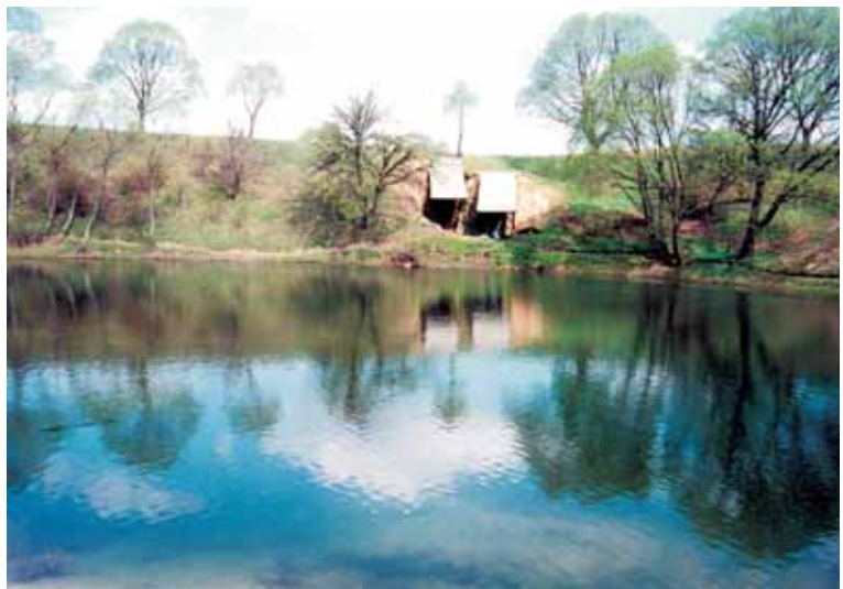
Fig. 4. An example of the selected representative geosite — outcrop of the Eemian sediments, Szwajcaria, NE part of Poland

In numerous geological-touristic and tourist maps in different scales, geosites and elements of protected inanimate nature are also presented in explanations.