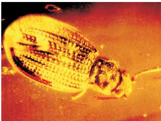
Fig. 2. “Type” specimens in museum collection are regarded as having the greatest scientific value of any material evidence. Holotype specimen Lathridius jantarius Borowiec, 1985 of the family Lathridiidae (Coleoptera) from outstanding collection of amber organic inclusions housed at Museum of the Earth PAS in Warsaw

C. Collections or individual specimens from classical localities now run out and no longer collectable. This unique ma-