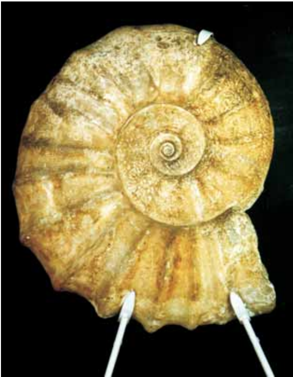
Fig. 4. Perfectly preserved, one of the biggest ammonite in Polish museum collections ( Anapachidiscus wittekindi ) from classical middle Vistula section; the Upper Cretaceous succession

This rare specimen links scientific, educational and aesthetic values; display collection of the Museum of the Earth PAS, Warsaw