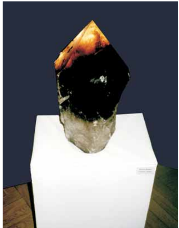
Fig. 6. Unique, large crystal of smoky-quartz from outstanding granitoid mineral-ferrous site

Strzegom, Lower Silesia, Poland; display collection in the Museum of the Earth, Warsaw