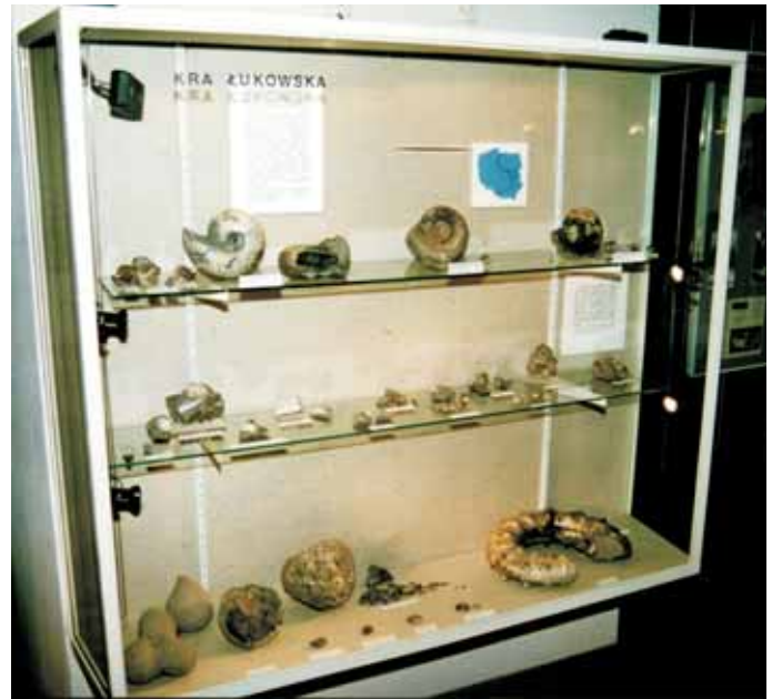
Fig. 5. Well-preserved Jurassic ammonite fauna collected from scientific important locality protected as Łuków Nature Reserve Now exhausted temporary exhibition in the Museum of the Earth, Warsaw

D. Unique or rare specimens, e.g. extraordinary, well-preserved fossils, perfect, well-formed minerals or attractive association of mineral species. In addition to their scientific value that specimen or collection may have many other values at the same time: educational, aesthetic and, sometimes, great importance as historical and cultural heritage. The utilisation of natural history collections values is often limited to exposing their information functions. Yet, many objects in natural history collections, especially geological ones, may have a great intrinsic beauty (e.g. minerals), therefore require a favourable position on the museum display. Other specimens, e.g. unique fossils, apart from purely scientific values, have an emotional expression connected with scientific idea, discovery or their historical significance as representing the natural and cultural heritage (Fig. 4, 6).