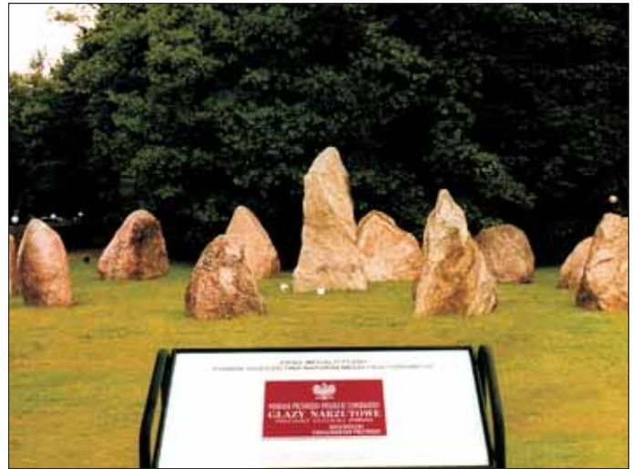
Fig. 8. Big erratic boulders belong to the largest group of inanimate nature's monuments in Poland

The so-called visitor centres are very important for the active protection of geological heritage. The centres offer an extensive educational programme beginning with museum display and ending with guided geological trails. These trails are situated within protected areas or sites, or nearby them. This concept is being successfully implemented in the U.S.A. and Canada, e.g. in the Dinosaur National Museum Visitor Centre (Colorado) or the Devil's Canyon Science and Learning Centre, Fruita, Colorado. A versatile, exemplary programme of in situ protection combined with research and educational functions is implemented in the famous Tyrrell Museum of Palaeontology and Field Station (Drumheller, Alberta, Canada), opened in 1985. Similar European examples may be found in the National Stone Centre and the Charmouth Heritage Coast Centre opened in Great Britain, Puy Du Dome Visitor Centre, France, and Garrotx Volcanical Park in Spain. Such initiatives will become still more