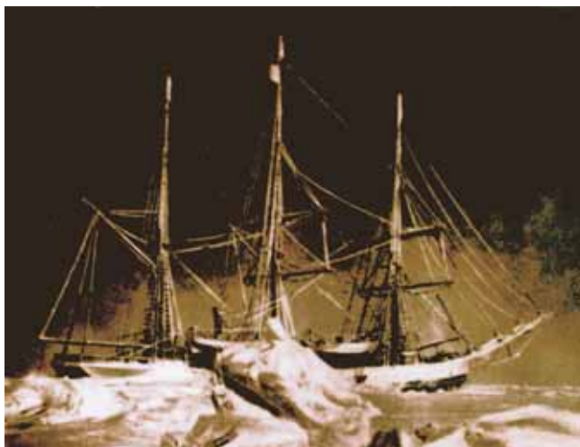
Fig. 7. Archival photo of famous “Belgica” ship from Antarctic Expedition (1897–1899)