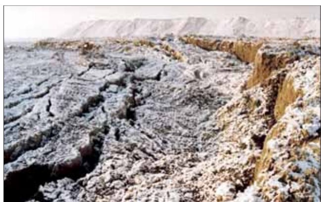
Fig. 6. Turów — landslide in the dump of the opencast mine

ern Poland (Fig. 1). Surface deformations caused by mining exploitation are most often observed in areas of old mines in the Upper Silesia and Lower Silesia. Opencast mining that brings about waste-tips is a specific stimulator of anthropogenic mass movements (Fig. 6).