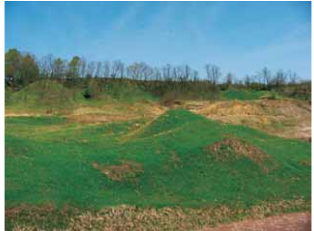
Fig. 2. Hebdow — landslide in the escarpment of the Wisła river valley

resistance of rocks is a probable reason of the limited intensity of landslide processes in the Sudetes and Holly Cross Mts. despite significant height differences of the terrain (Synowiec, 2003). Landslide processes in loess develop in a specific way and are stimulated by the suffosion together with destructive action of floral root systems (Łukasik, 2002).