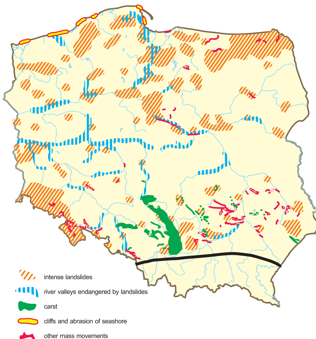
Fig. 1. Natural geological hazards of Poland (compiled from archive materials and own field research)

dercut by abrasion (Fig. 1). The development of landslides depends on the geology of the area, topography, groundwater migration and surface water activity. The Flysch Carpathians are a region where landslide processes frequently occur (Oszycko et al. , 2002; Łukasik, 2002; Poprawa, Rączkowski, 2003). There, the joint effects of the lithology and structure of near-surface rocks, steep slopes and strong erosion of surface and groundwaters overlap. As a result, about 90% of observed landslide activity is recorded in the Carpathians (Łukasik, 2002). In the rest of the country, landslide processes develop mainly at river banks and steep slopes of ice-marginal valleys (Fig. 2). An increased development of landslides is observed in young glacial moraines of northern Poland. High mechanical