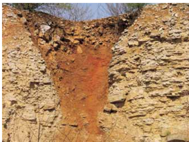
Fig. 5. Ligota Dolna sink — karst