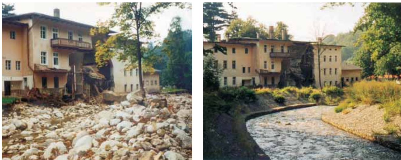
Fig. 8. Wilczka river valley (Sudetes Mts., Śnieżnik Massif near Kłodzko) after 1997 flood (left) and after damage removal in 2002 (right)

Of minor importance is a hazard put by the migratory sand. Hard to control and dangerous at the margins of great deserts, the migratory sand in Poland occurs locally at those parts of the Baltic Sea shore where accumulation dominates (Fig. 7) and near Olkusz where the groundwater level has been lowered as a result of mine draining.