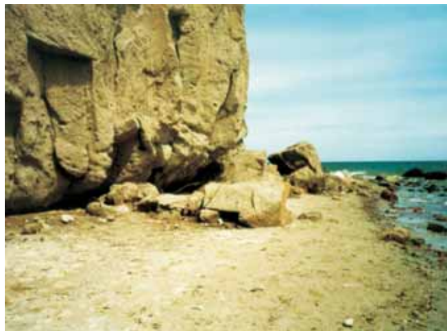
Fig. 4. Gdynia-Orlowo — rockfall in the cliff and abrasion of the seashore