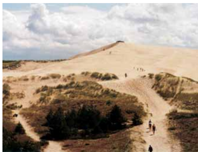
Fig. 7. Łeba — migrating dune

Surface mass movements do not close a list of hazardous geological processes. The neo-tectonic activity plays also a certain role. There are no noticeable destructive effects of the neo-tectonic activity in Poland, however, earth tremors with small or medium energy can endanger buildings and technical infrastructure. Natural tremors in mining areas are accompanied by numerous mining-induced shocks and it is often difficult to differentiate one from another. An increased seismic activity is observed in mountainous regions of southern Poland as well as in the Upper Silesia Coal Basin, Bełchatów Coal Basin and Lubin Copper Basin.