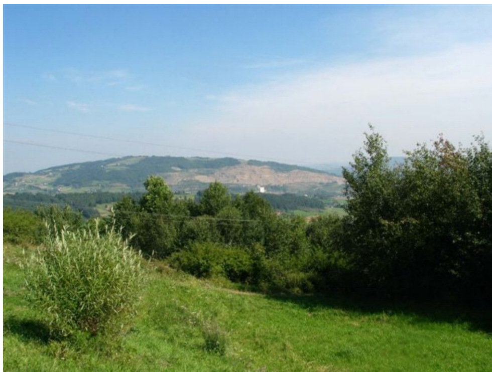
Fig. 2. Multilevel Kłęczany sandstone quarry (picture K2 )