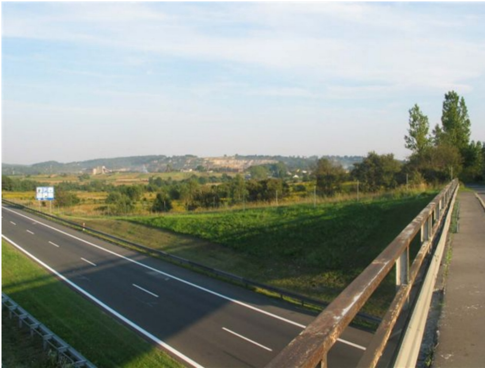
Fig. 6. Porphyry opencast quarry at Zalas near Kraków (picture Z1)