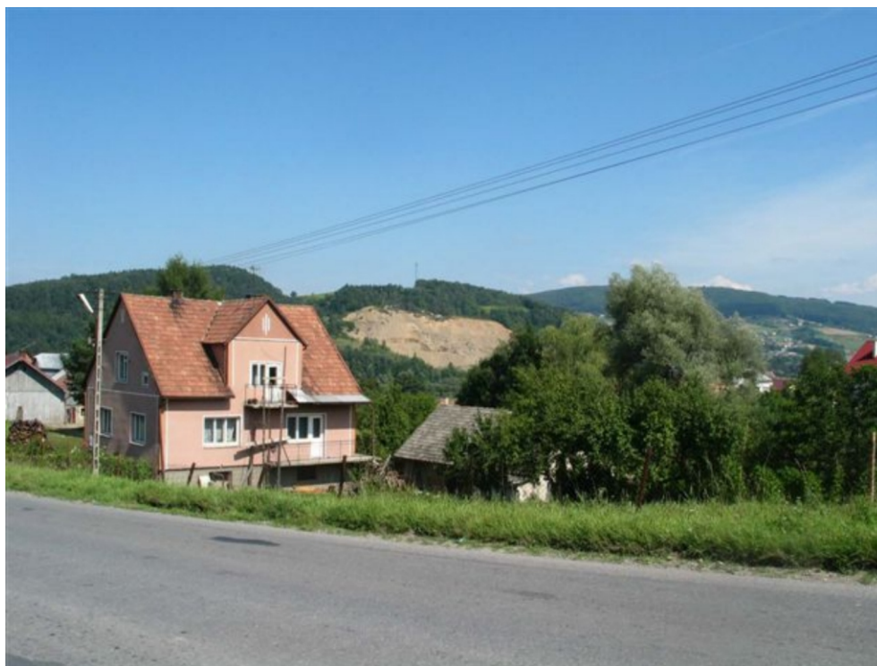
Fig. 4. A face of the Dąbrowa sandstone quarry (picture D3)

However, the variability of the L_v level is not always consistent with the variability of the x indicator. This result was to