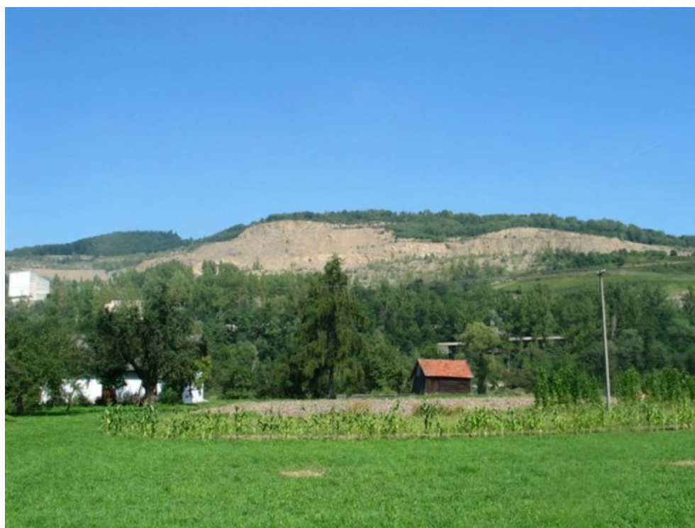
Fig. 3. Multilevel Kłęczany sandstone quarry (picture K4)

and 3). The Oligocene Cergowa Sandstones extracted in the thick-bedded Kłęczany deposit are grey in colour and fine- to coarse-grained. The deposit includes several sandy lenses within shale sequences. The thickness of the sequence exposed in the quarry varies from 5.9 m to 226 m. The average content of shale in the profile of the deposit is 23%, but it differs in individual successions from about 5% to more than 90%. The sandstone itself has good technical properties, in particular a high compression strength. It is used as high quality material for railway and road construction.