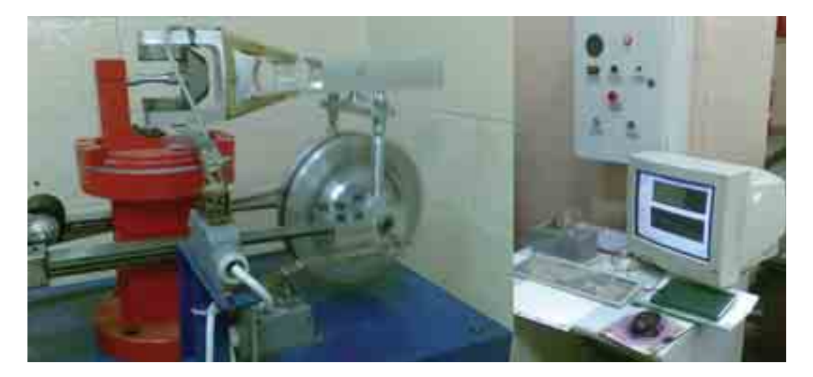
Fig. 2. The laboratory fatigue testing of materials

The position of Fig. 1 allows you to perform fatigue tests in bending, torsion and bending and twisting at the same time with different share of the burden. The transition between bending and twisting is achieved by rotating the head stable, in which is attached to the test sample. When the