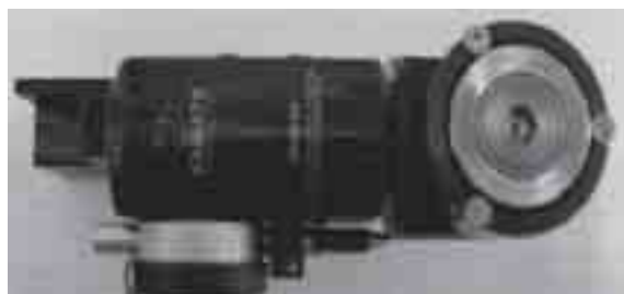
Fig. 2. Burnishing tool