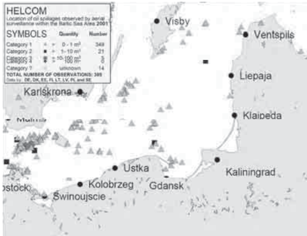
Fig. 2. Aerial detections of oil during air surveillance in one year in the Southern Baltic – example. Processed after HELCOM portal ( www.helcom.fi )