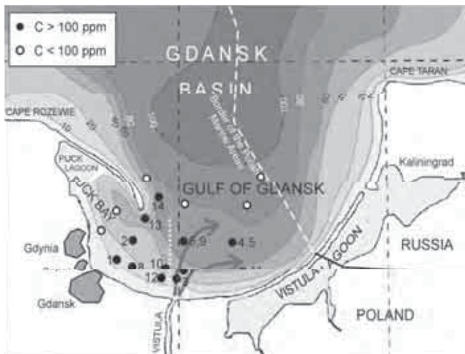
Fig. 3. Map of investigated area in the Gulf of Gdansk with points of water sampling. Dotted white line indicates offset yield of Vistula River disturbance area, narrows – the most probable direction of spread of the Vistula waters

Entire tested basin could be divided for two parts: the area, where the Vistula impact occurs, that is east of the river mouth, and the area west of the mouth, where does not direct impact of the river. It was assumed that contamination might have flow down the Vistula River if a point is to the east of the meridian of 18°55' (dotted white line in Fig. 3). Average concentration of oil in the water is estimated as 5.0 \cdot 10^{-8} in the east-area and that is more than in the west-area, where the mean concentration is 3.8 \cdot 10^{-8} . This fact confirms petroleum runoff the land based sources with the river water. It is important here that eight of the fourteen highest concentrations refer to the places west of the boundary meridian.