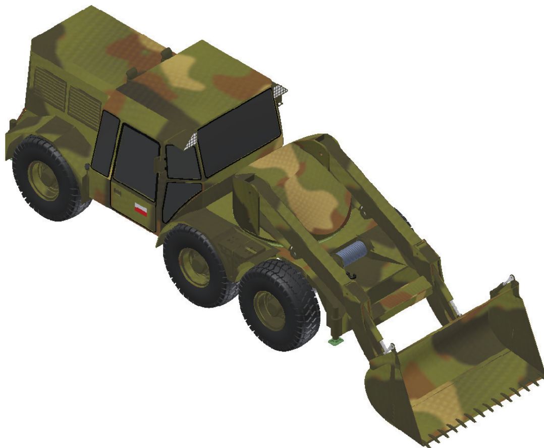
Fig. 1. 3D model of a multipurpose engineering machine

current solutions for working machines relating to requirements, which should be met by the machine.