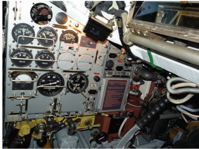
Fig. 1. Classic driver's panel

Previously reported changes started with the introduction of modifications within the driver's panel - such as shown below, equipped with indicating devices monitoring traction engine parameters and switches used to start additional on-board equipment.