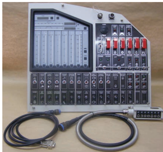
Fig. 2. PK-08 driver's panel together with PW-08 remote panel

Environmental resistance of this type of mechanical apparatus was on the border of the requirements of the military standards, and their cost disproportionately increased together with the need to maintain resistance to vibration and mechanical shock resulting e.g. gun firing. Despite the considerable cost of the panel, it was used for many years and serve to this day. It is a modern mobile electronics with additional equipment selection for the military contributed to the emergence of a new generation of instruments.